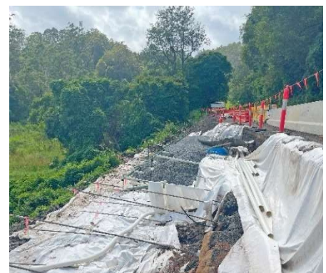
Blue Knob Road (Site DM01361/DM01449)