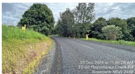
Repentance Creek Road

Pavement stabilisation and bituminous sealing works were completed during December with the project continuing finishing works in the new year, progressing towards completion.