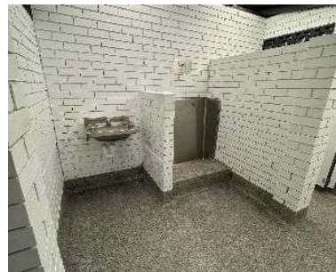
Riverside Park Toilets