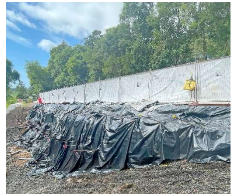
Blue Knob Road (Site DM01366)