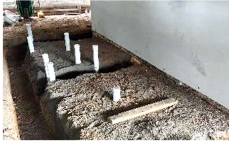
Visitor Information Centre

New slab hydraulics are installed and new slabs footings excavated ready for concrete pour. Internal hydraulics installation almost complete.