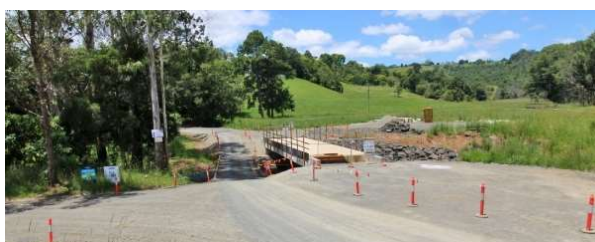
Branch Creek Bridge

In December, significant progress was made, key accomplishments included the backfilling of abutments, installation of bearing pads, successful landing of pre-stressed concrete beams, and the completion of the concrete bridge deck, which involved forming up, steel tying, and pouring. Looking ahead to January and February, the project will focus on finalising the construction of new bridge approach works and demolishing the existing causeway structure. Additional tasks scheduled include bitumen sealing of the approaches, road furniture installation, and site de-establishment. These upcoming works will mark the projects final stages, bringing it closer to completion.