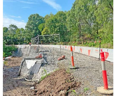
Blue Knob Road (Site DM00680)