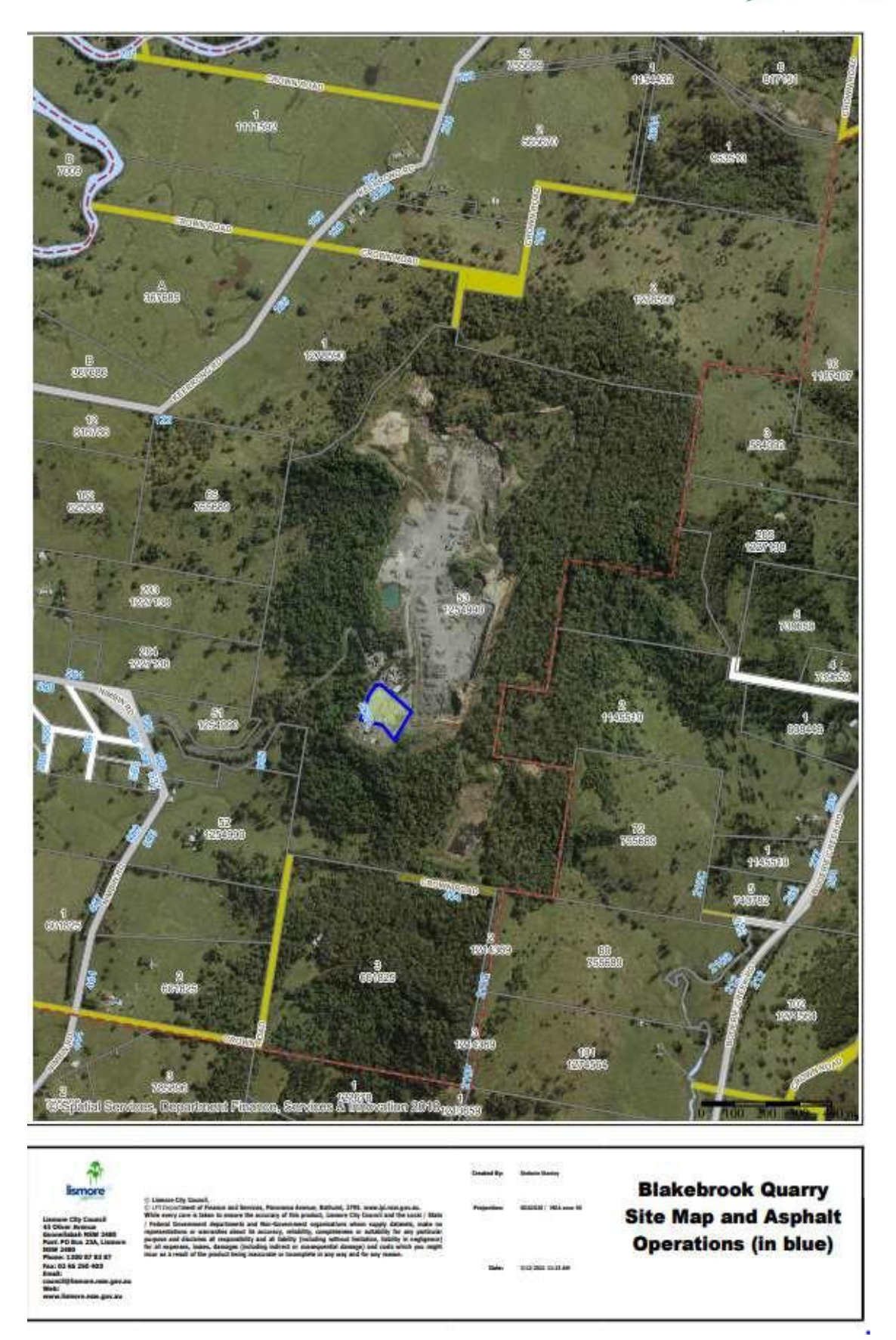
Figure 1. Site Map