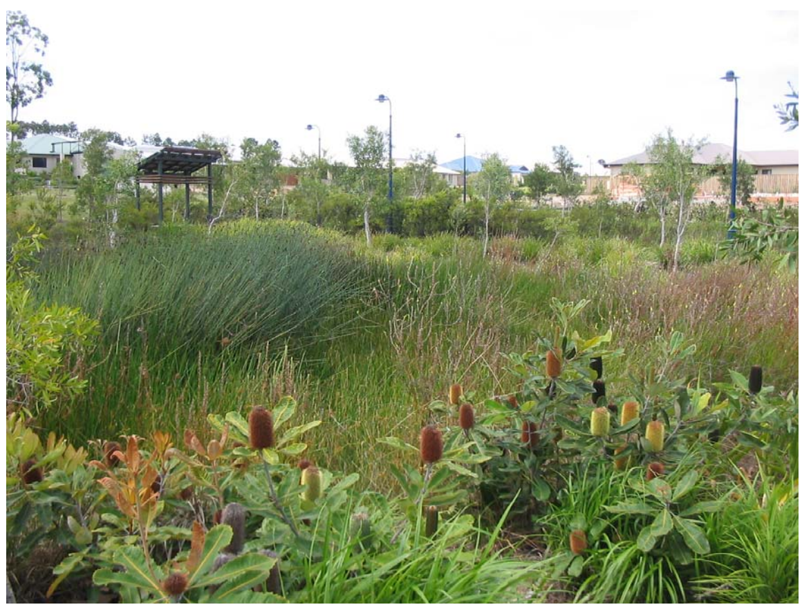
Plate 1.7 Constructed stormwater wetland in a residential setting

Photos of constructed stormwater wetlands are provided in the following plates.