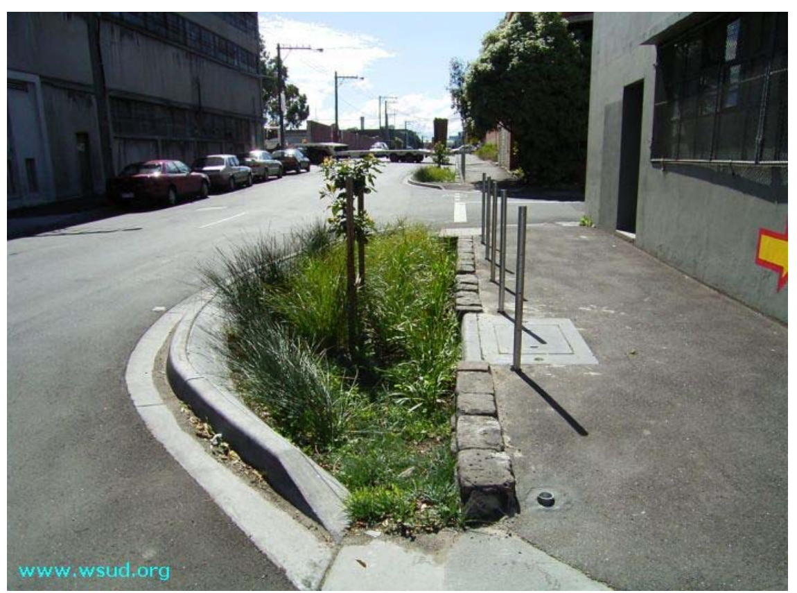
Plate 1.6 Bioretention pod in road