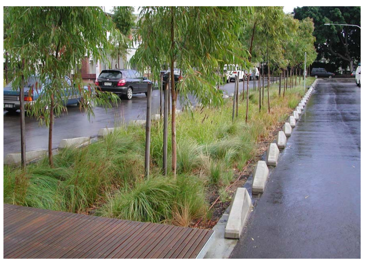
Plate 1.4 Bioretention swale in the centre median of a road