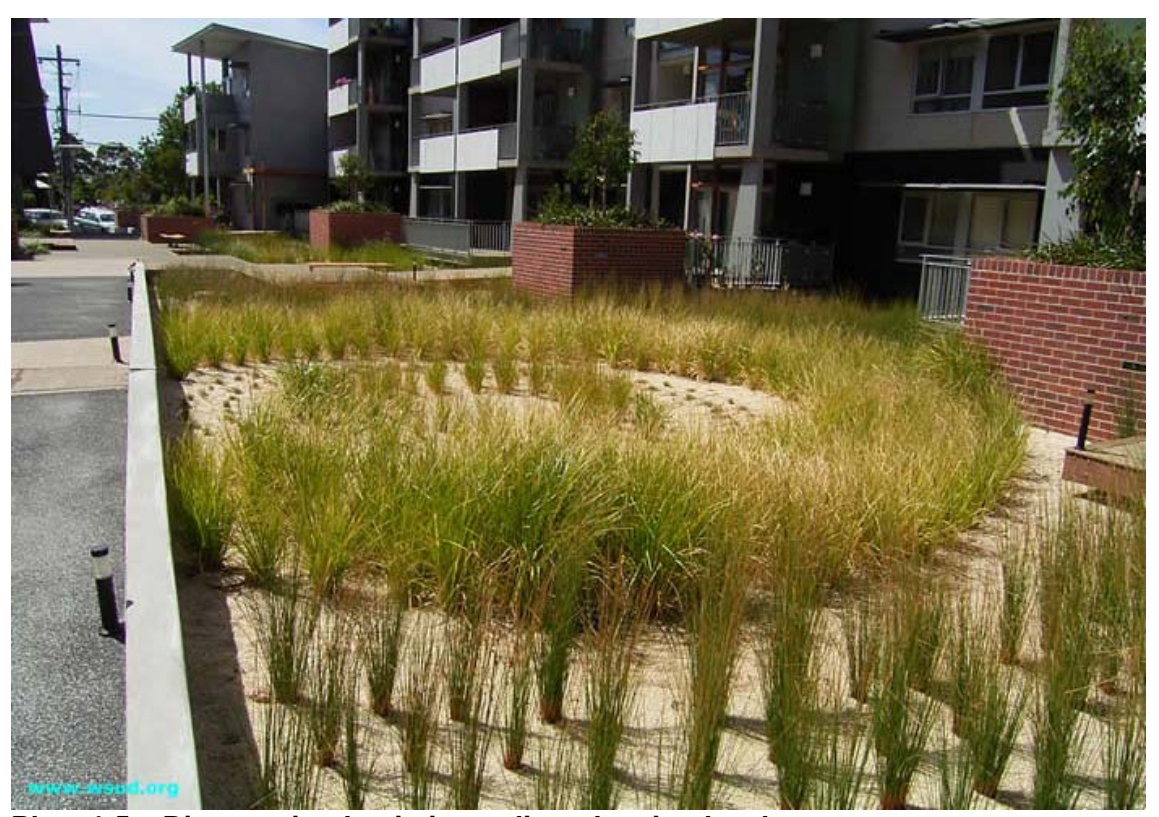
Plate 1.5 Bioretention basin in medium density development