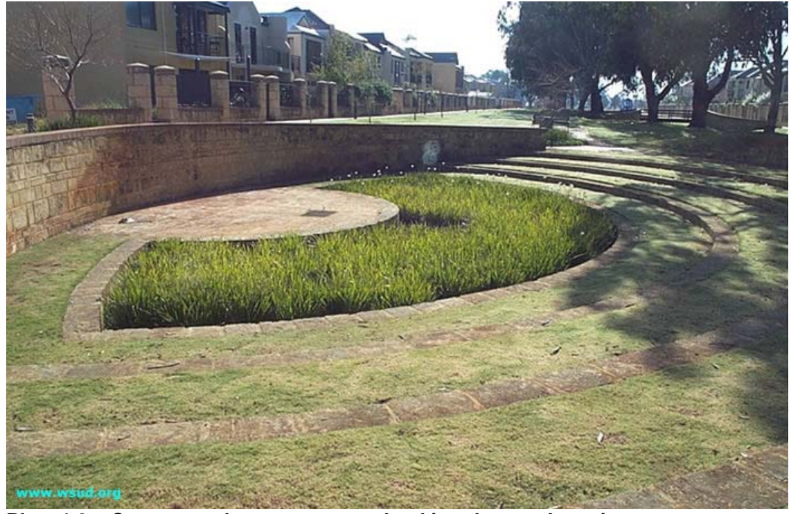
Plate 1.9 Constructed stormwater wetland in urban park setting