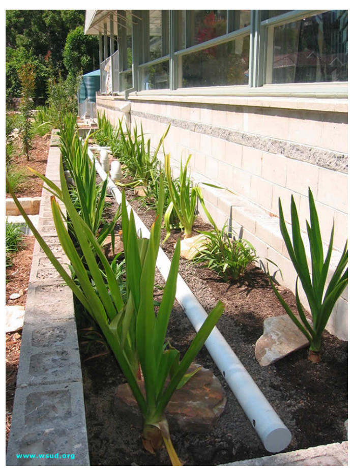
Plate 1.2 Bioretention planter box