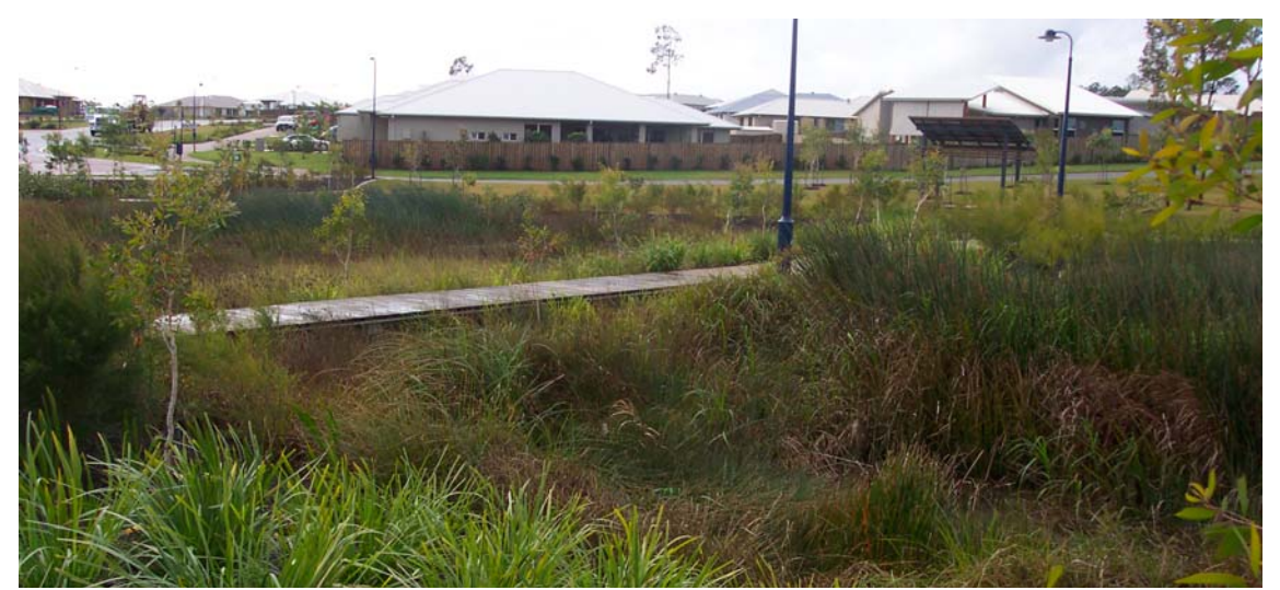
Plate 1.8 Constructed stormwater wetland with boardwalk