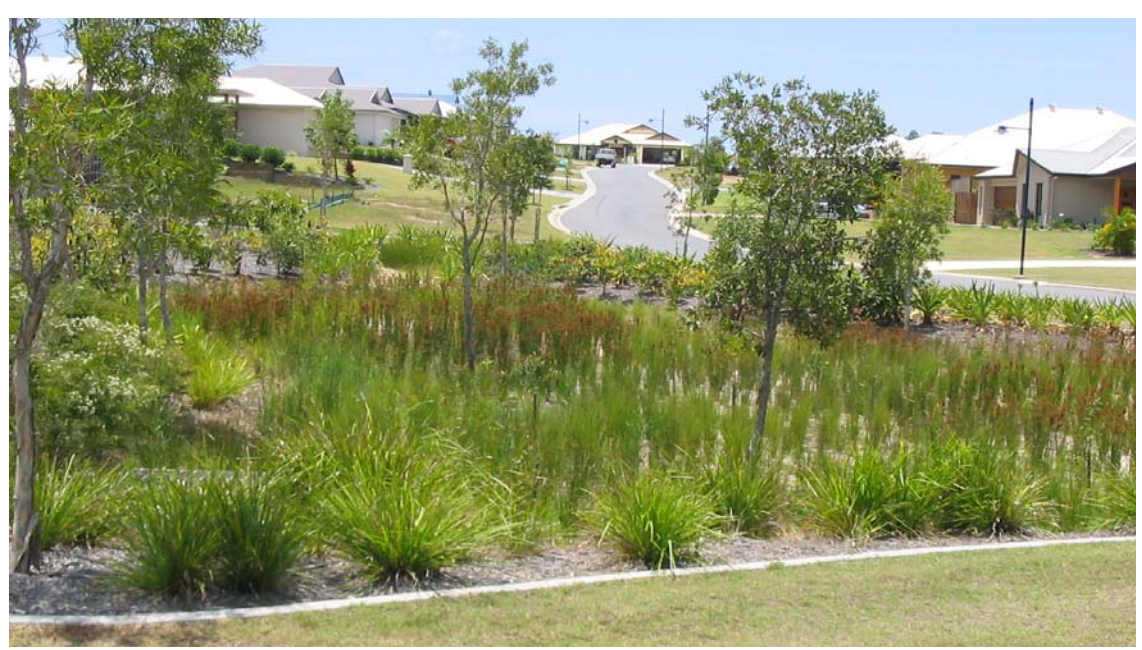
Plate 1.1 Bioretention basin in a streetscape setting

Photos of bioretention systems are provided in the following plates.