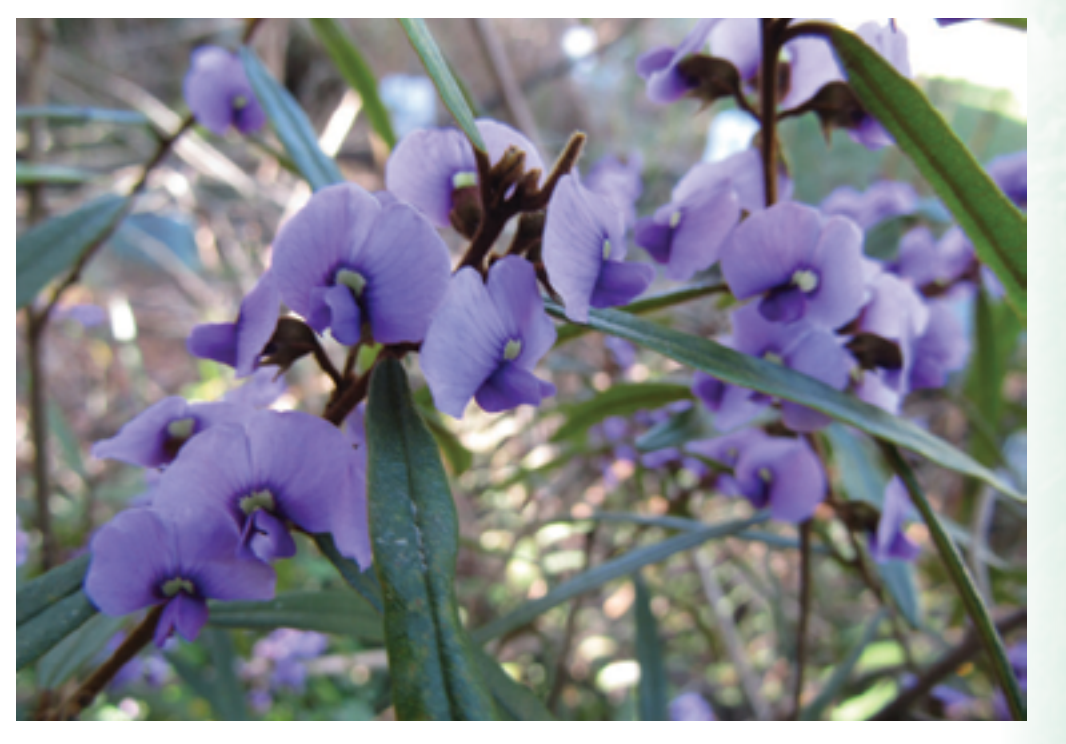
Photos: (Above) Hovea acutifolia & (Cover) Superb Blue Wren by Phil Jarman

the western end of the Gardens, just beyond the Nursery. The Hoop Pine Forest, at the eastern end, is a lovely cool shady place to walk. The paths, unsealed but well graded, take you up to a stony labyrinth at the top and the installed big old church bell, a little further along the ridge.