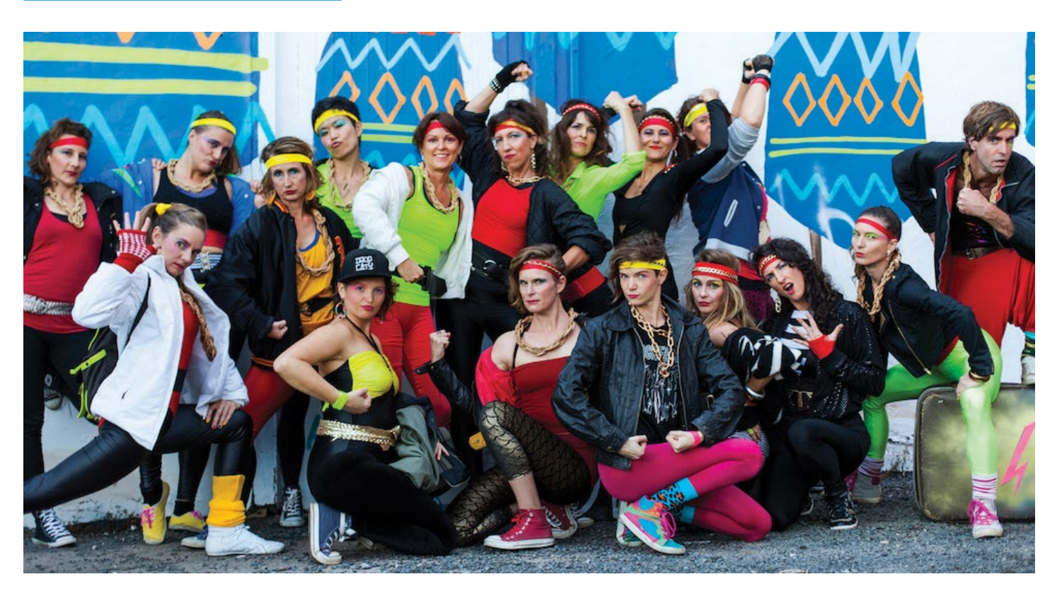
Local dance group The Cassettes are one of the many acts who will be trying to impress judges at the Fast Track Talent Showcase.

It's shaping up to be a big weekend of music in Lismore later this month with the Fast Track Talent Showcase coming to Lismore on 26 and 27 September.