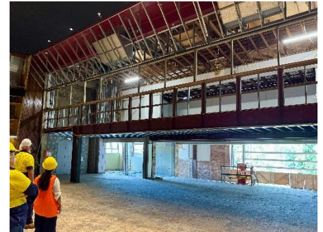
Lismore City Hall