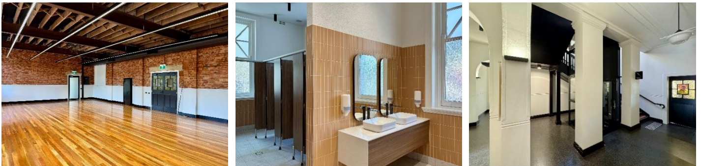
Lismore Municipal Building

Driveway works continued throughout the month of February, with internal restoration now complete.