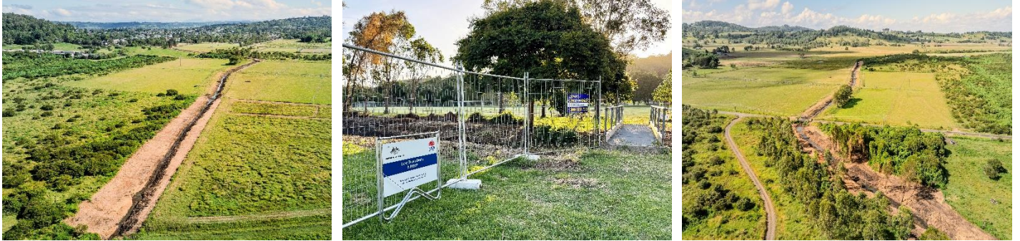
East Town Drains

Completed across a three-week period in February, the East Town Drains project saw the repair of a 1,400-metre open drain system, adjacent to Wyrallah Road Public School, Lismore Thistles Soccer FC and Wade Park. Works saw the removal of invasive coral trees and debris, restoring optimal flow to the section of stormwater drainage connecting to Gundurimba Canal. Works were funded by the Northern Rivers Recovery and Resilience Program (NRRRP). Read more.