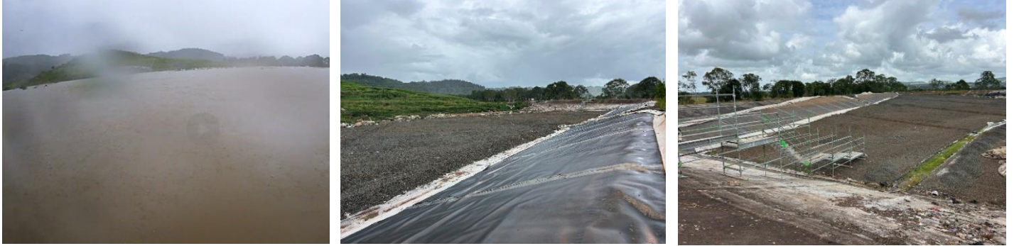
Left: Cell 2B in 2022. Above and right: cell 2B de-watered in February 2025.

The team has been preparing the damaged landfill cell at Wyrallah Road so restoration works can begin. In February, we dewatered the cell by pumping and safely removing contained water. Tropical Cyclone Alfred added an additional seven megalitres of water into the cell, which is equivalent to three Olympic swimming pools! Dewatering works will continue over the coming weeks with early restoration works set to begin next month.