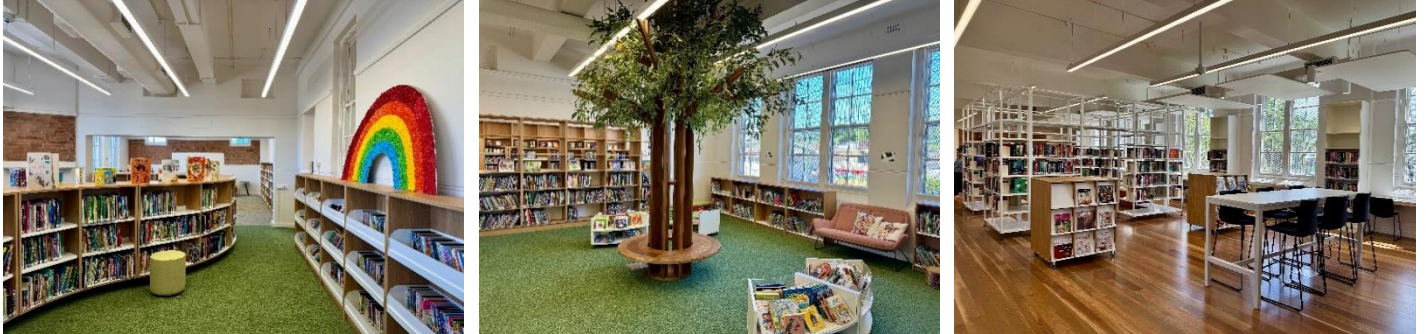
Lismore City Library

Works were completed and Lismore City Library reopened to the public in a soft opening phase, ahead of its official launch later in the year. The overwhelming sentiment is how happy the community is to have it restored, with the internal improvements aimed at making it more resilient in future weather events greatly supported. A replacement lift has been ordered and will be fitted as soon as it arrives.