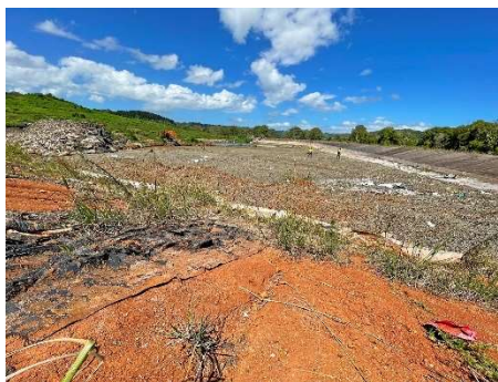
Lismore Waste Facility

Onsite investigations have commenced to assess the damage caused by the 2022 flood event. These activities involve removing landfill media to expose lower containment systems, enabling engineering teams to determine the extent of replacements and repairs.