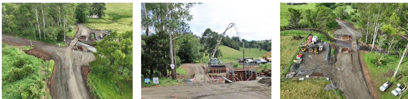
Branch Creek Bridge

Site establishment and initial earthworks are complete, along with pile installation and the forming and pouring of abutments A and B. Civil works are currently 50% complete. The installation of bridge beams is scheduled for 09/12/24, followed by the forming and steel tying of the bridge deck. The concrete pour for the bridge deck is planned for 19/12/24. Final civil works will be completed, and the bridge will be open to traffic by 30/01/25, subject to weather conditions.