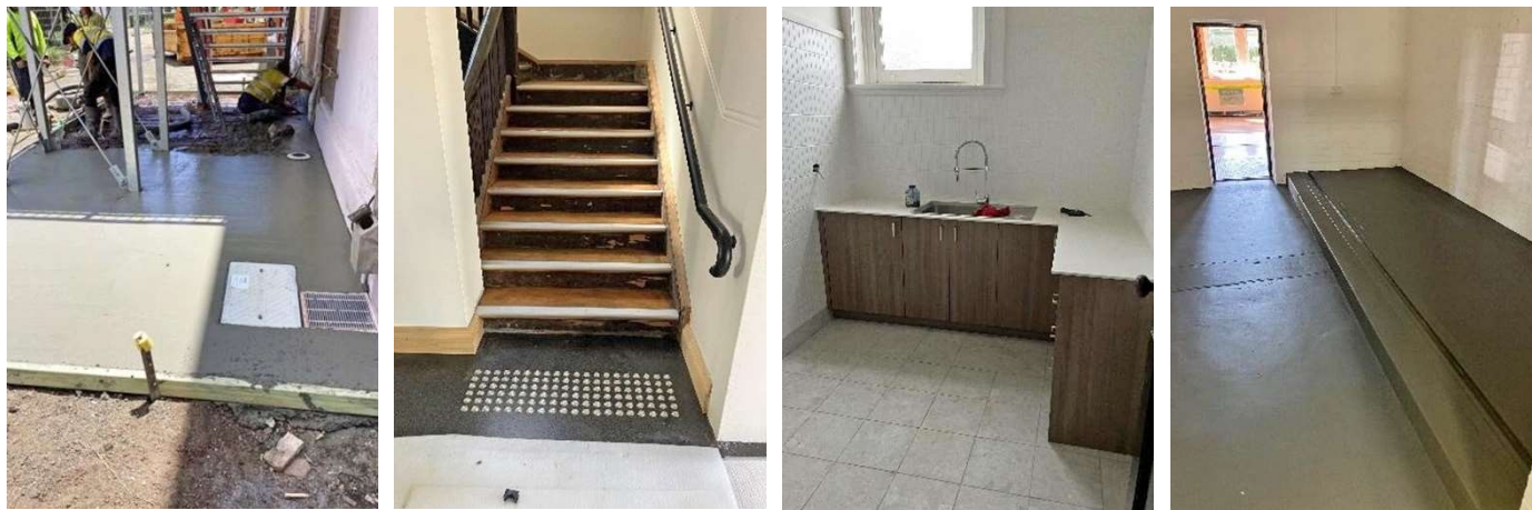
Lismore Manicipal Building

During November at the Municipal building, nosing was installed on the internal stairs. The work on the Safe Room and kitchen area is progressing well. The driveway works are ongoing, and concrete was poured at the base of the rear stairs.