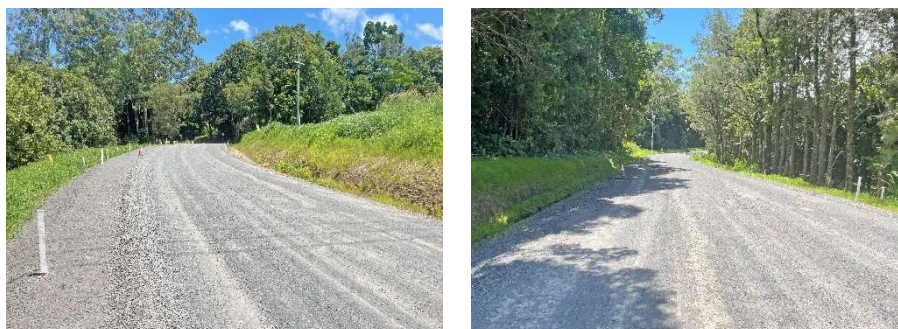
Repentance Creek Road

Repair works are well underway with roadside drainage completed; this will be followed by a pavement seal in the coming month.