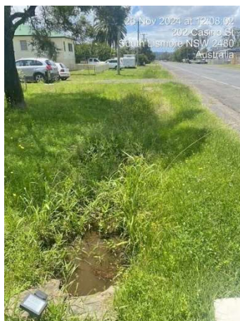
Casino Street – Far End