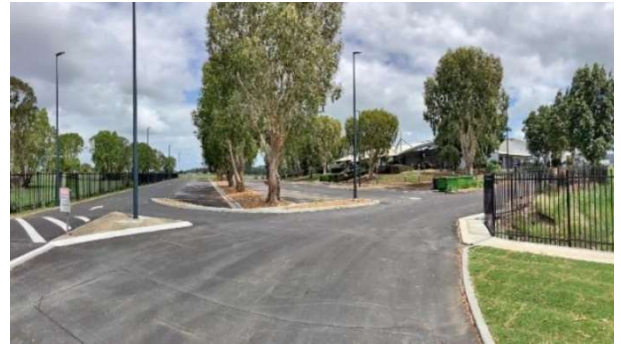
Lismore Regional Airport