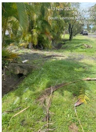
Crown Street – Tree Removal

During November, work was focused on the open drains in the CBD area. Crown Street has experienced significant rainfall, and both the council and residents should be aware that street gardens contribute to obstructing water flow in drains. Late November, the Caniba Street drain needed correction and the far end of Casino Street is scheduled for work in early December. The CBD open drain cleaning project will complete its funded scope in early December.