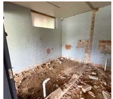
Visitor Information Centre