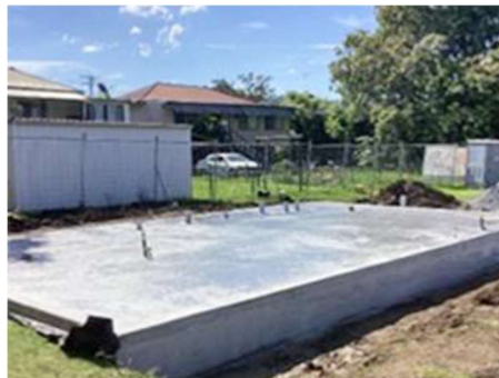
Riverview Park – Concrete Slab Pour