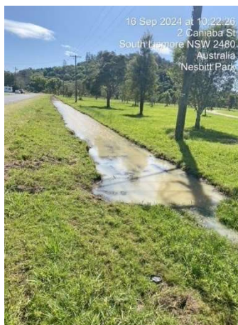
Caniba Street – Exposed water pipe removed