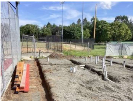
Albert Park – Early Form Work