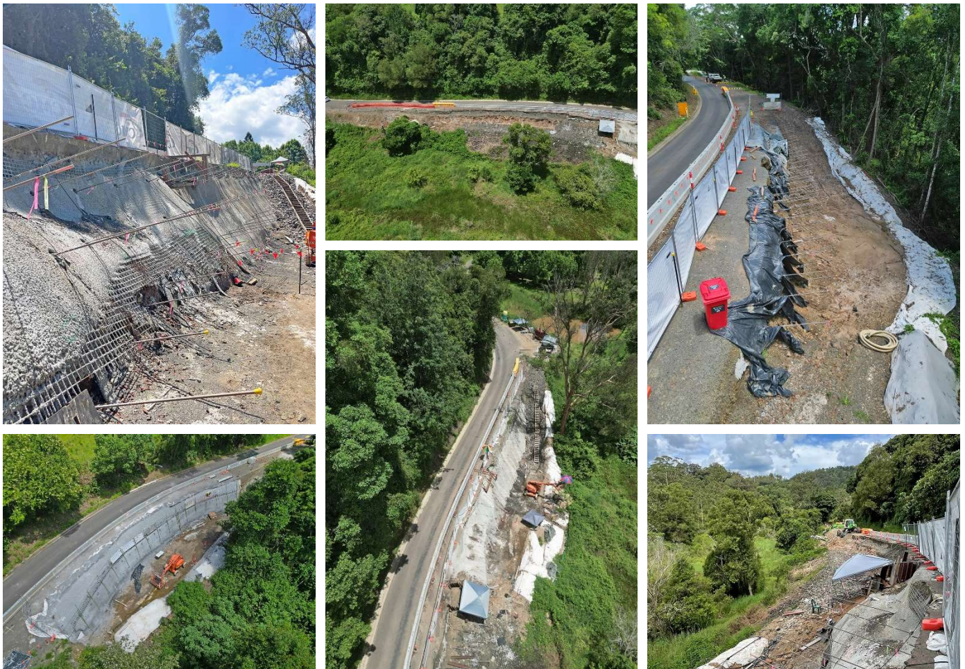
Blue Knob Road

Lastly, Site 3 (DM01361/DM01449) is proceeding on schedule with the CMC subcontractor completing the installation of 95% of the permanent soil nails at this site. In the following weeks, CMC will undertake the acceptance test on the nails selected by the principal to verify the overall quality of the work. This will allow the commencement of the backfilling operations and installation of the shotcrete on walls 3 and 4.