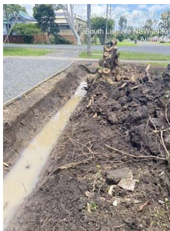
Casino Street – Tree Removal