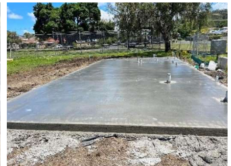
Neilson Park – Concrete Slab Pour