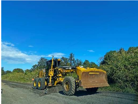
Gungas Road – Grading Works

Efforts persist in grading over 120 kilometres of 53 unsealed gravel roads, which suffered substantial damage due to declared natural disasters in December 2023 and April 2024. The most severely affected roads receive highest priority to expedite critical route restoration. This ambitious project, one of the largest of its kind, involves Council deploying six distinct work crews, strategically clustered geographically to optimise efficiency and resource allocation. Recently, HXR conducted grading on Gungas Road and expressed gratitude to the supportive residents they have encountered to date.