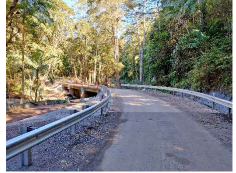
Terania Creek Road – Bridge 3 Completed