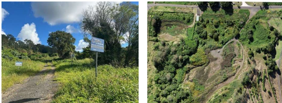
Three Chain Road Quarry

Located on 12.9 hectares, the formerly abandoned Three Chain Road Quarry has excitingly reopened. The site now serves as a revenue stream to support the creation of a rehabilitated green space and koala habitat. Managed by the Flood Restoration Roads and Bridges team, the quarry is accepting Excavated Natural Material (ENM). Any material disposed must undergo rigorous testing with documented proof of addressing strict environmental standards.