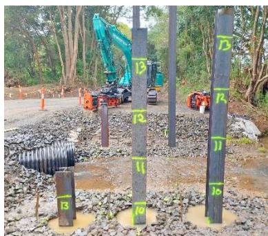
Eureka Road – Piling Works