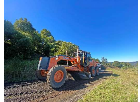
Wallace Road – Grading Works