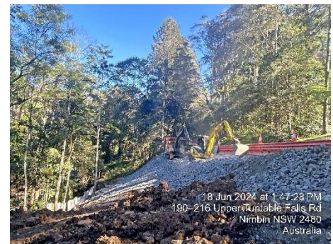
Upper Tuntable Falls Road