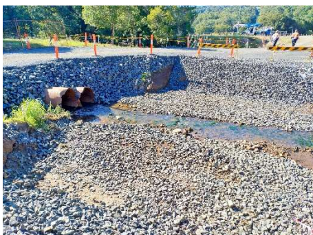
Graham Road – Bridge Piling Pad

The side tracks and earthworks are completed at all three sites. On Eureka Road piling is now completed and installation of a new Inquik bridge is planned for early August. Piling commenced on Haywood Lane 26 June and is also scheduled for Inquik bridge installation early August. Following these works, piling will begin mid-July on Graham Road due to essential energy power outage required to commence these works. Throughout construction, road users will continue to utilise the side tracks to minimise traffic disruption.