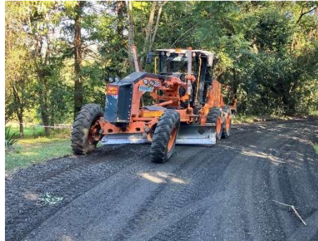
Wallace Road – Grading Works