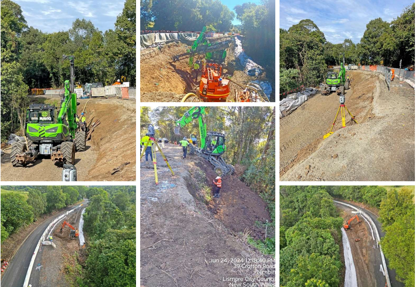
Blue Knob Road

Work is underway on the first of four landslip sites along Blue Knob Road. Contractor CMC is currently focused on the site closest to Nimbin, where they are constructing two soil nail walls. Once this stage is underway, they will proceed to establish the second site for excavation. The restoration of all four landslips in this project is anticipated to span 10 months, subject to weather conditions.