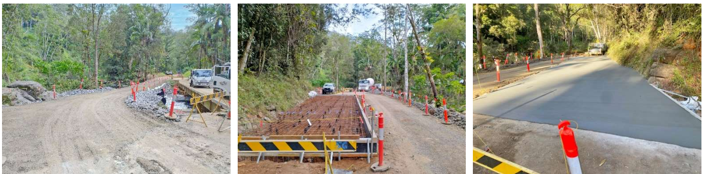
Terania Creek Road – Bridge 2 Construction Works

Thrillingly, construction works on Bridge 3 are now complete. Crews have moved onto Bridge 2 where a side track is in place and works are underway for new approach slabs and restraint bracket installation. After, crews will relocate to Bridge 1 to construct a sidetrack early to mid-July and commence approach works.