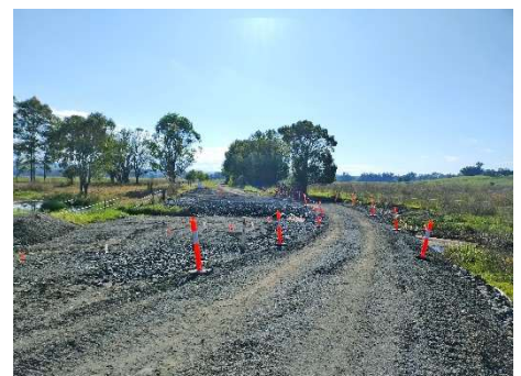
Haywood Lane – Piling Pad & Sidetrack