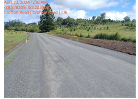
Crofton Road pavement restoration