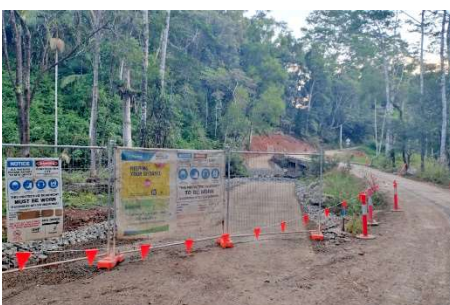
Bridge 1 – Progress Works

Project is underway for bridge 1, 2 and 3. Bridge 3 has new concrete bridge approaches and scour protection completed with guardrail installation scheduled during early May. After this, installation of lateral restrains brackets will follow. Approximately 50% of bridge 2 and 1 have side track installations complete. These will continue during May, subject to weather conditions. Once completed, installation of concrete approaches and guard rail for bridges 2 and 1 will follow.