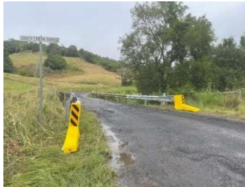
Oakey Creek Bridge

The Flood Recovery Guardrail replacement multisite works are now complete. A recent project included the installation of guardrails at Kyogle Street and Oakey Creek Bridge. Thanks to all motorists for their patience during the works.