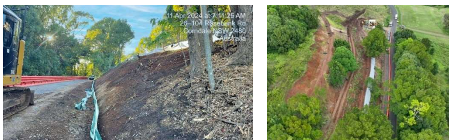
Rosebank Road – Completed Works

Landslip restorations are complete at Rosebank Road. The works involved reinstating the property access track and restoring the batter and table drain along the road edge.