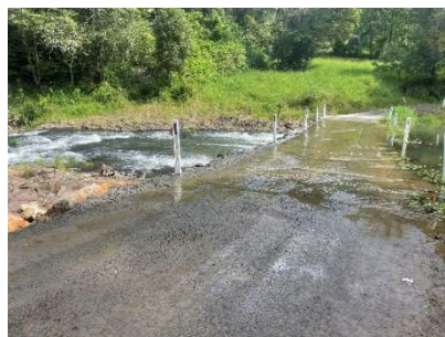
Black Road causeway

The causeway has been resurfaced following recent deterioration by high water flows. The road is now repaired and new guideposts installed.