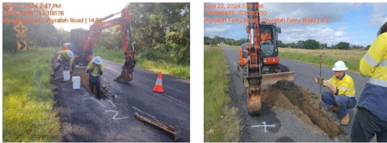
Coraki Road – Progress Works

Geotechnical works are completed on Coraki Road they will enable engineers to design and construct remediation works to deliver roads that are safer and more durable. The design phase is now in progress.