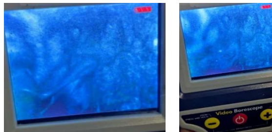
Bat Inspection Images

Through successful collaboration with environmental professionals the juvenile micro bats were temporary relocated during April. Works were able to commence April 29, to start on the culvert replacement project. Thank you to the community for your understanding and patience while we relocated this projected species.