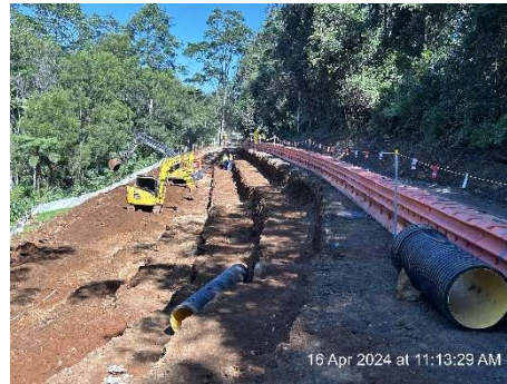
Upper Tuntable Falls Road – Progress Images