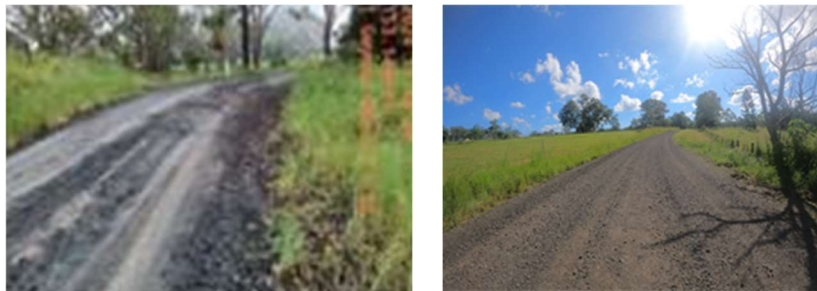
Gwynne Road – Before and After Works

Maintenance crews were busy inspecting and providing maintenance on many roads throughout the region. To improve road conditions, crews continued to provide pothole repairs on Tuntable Falls Road and Stony Chute Road along with grading and pothole repairs on Gwynne and Yeager roads. Priority works have also commenced for Zouch Road involving a light grade and repairs to the road surface.