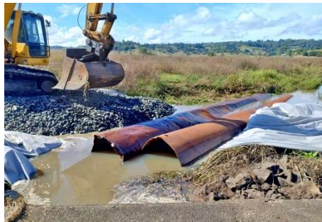
Haywood Road Site

Works have commenced on the culvert to bridge structure replacement project at Haywood Lane. Construction has begun on installation of side tracks with piling to follow next month.