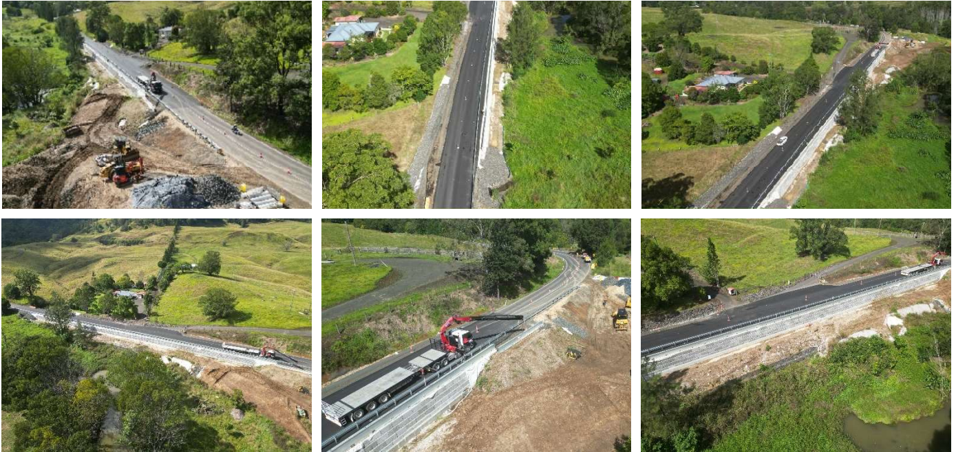
Nimbin Road – Site 4Km (Near Shipway Road) Works

Works are nearing completion on Nimbin Road at the site near Shipway Road. During the past month, works were completed for the construction drainage along the retaining wall and placement of road base layers along the full width of the road. The road has now been sealed with asphalt and guardrails installed. Remaining work includes line marking and the installation of guideposts. The road is due to be officially opened on 11 May.