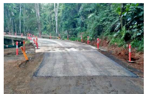
Bridge 3 - Showing new approach slab.