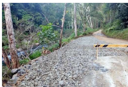
Bridge 2 – Progress Works