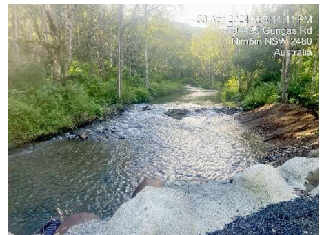
Gungas Road – Progress Images