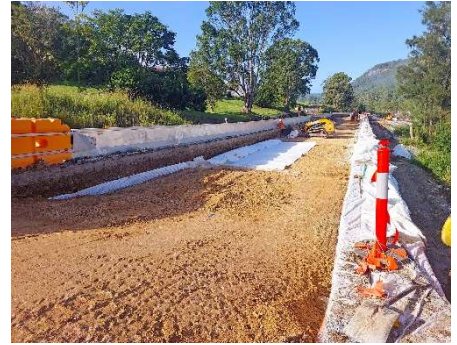
Nimbin Road – Site 4Km Works