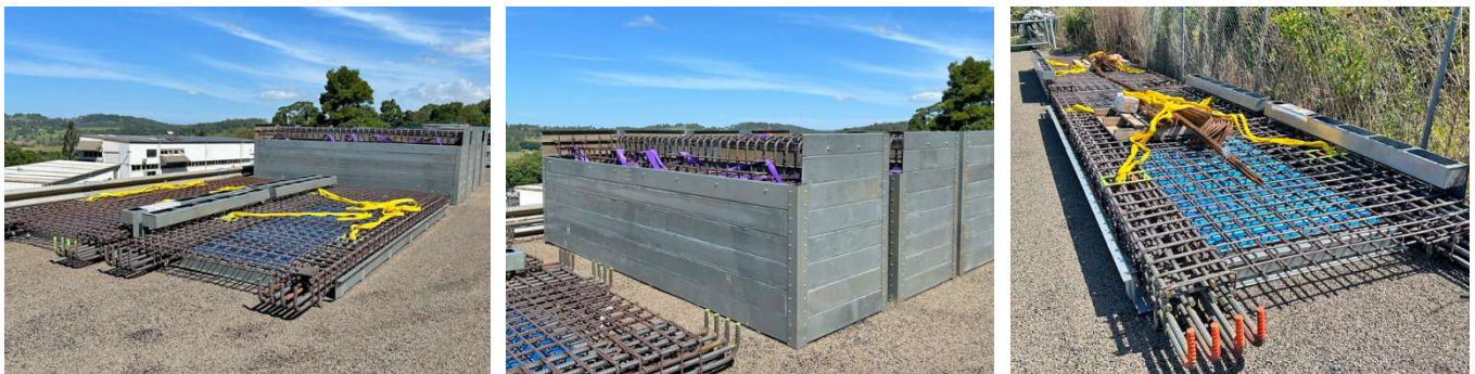
Bridges Delivered to storage yard

During the end of February, all three bridges were successfully delivered to Council storage yards. The designs for each site are in the final stages with works schedules being finalised. We apologise in advance for any disruptions you may experience while we carry out this essential work. These works will involve removing the existing infrastructure at each site and preparing the area for bridge construction. To minimise impact to residents and traffic flow during the construction work a temporary track will be established as a side road. The work duration at each site is expected to be approximately 6 weeks, subject to weather conditions.