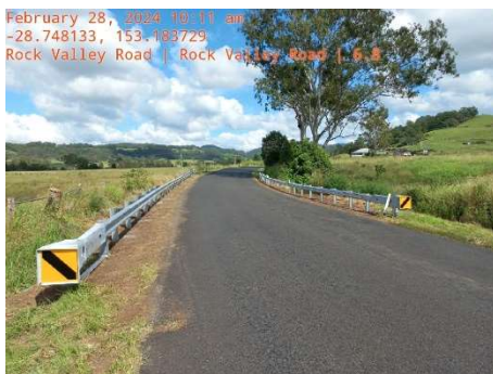
Rock Valley Road