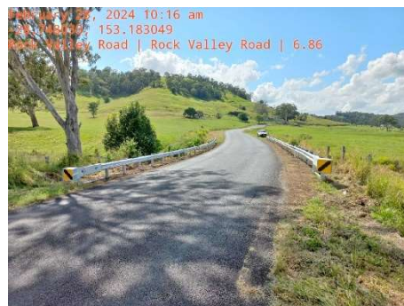
Rock Valley Road