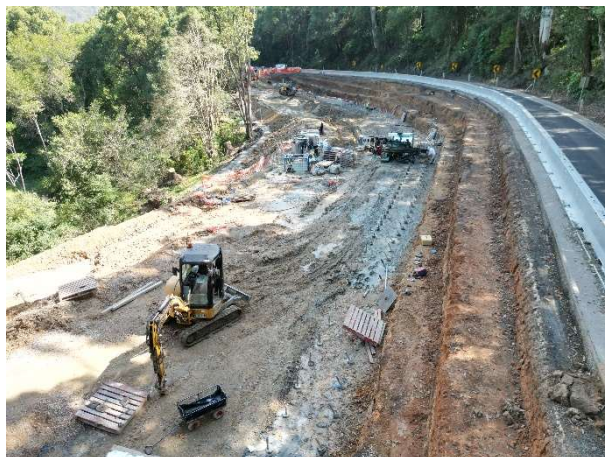
Nimbin site 1km works during August

The piling works were completed on August 23rd for Site 1km, approximately 1 Km from Nimbin. The drilling rig has now been relocated to Site 4km, approximately 4 Kms from Nimbin. The concreting of the pile cap, the base of the block retaining wall, has also commenced. Earthworks are now complete, and the piling is due to commence at the 4km site in early September.