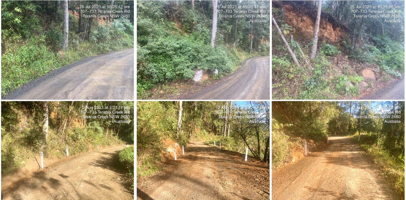
Before and After photos for Terania Creek Road

Council recently completed maintenance work on Terania Creek Road to improve safety for road users. Guideposts were added, debris cleared, and large boulders removed which were partially blocking the road. The Flood Recovery – Roads and Bridges team would like to thank the community for their positive feedback and resilience during the flood restoration process.