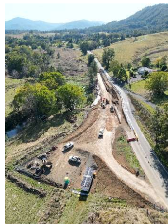
Aerial view of Site 4km works