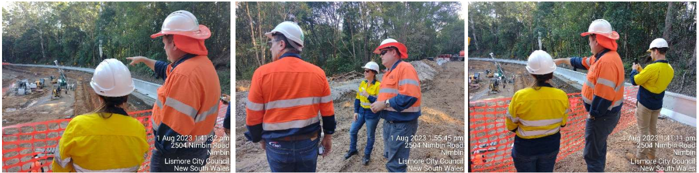
EPA Site Visit at Nimbin Road Landslip Sites