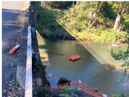
Vandalism at Site