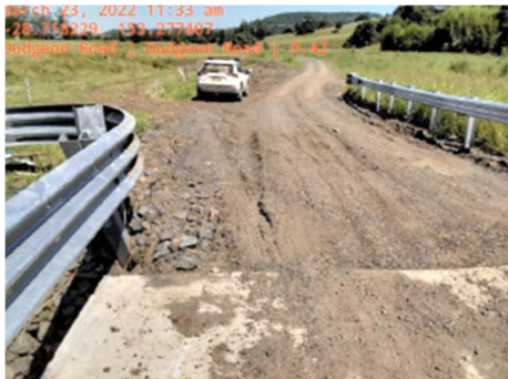
Dudgeon Bridge Approaches

Works are due to commence in the next two weeks on the reinstatement of Dudgeon Bridge approaches on Dudgeon Road. These works will involve removal and reinstatement of the flood damaged bridge approaches which will include an asphalt wearing surface. Following completion of Dudgeon Bridge, works will then commence on Bungabbee Bridge approaches. Both projects will take approximately two weeks each to complete.