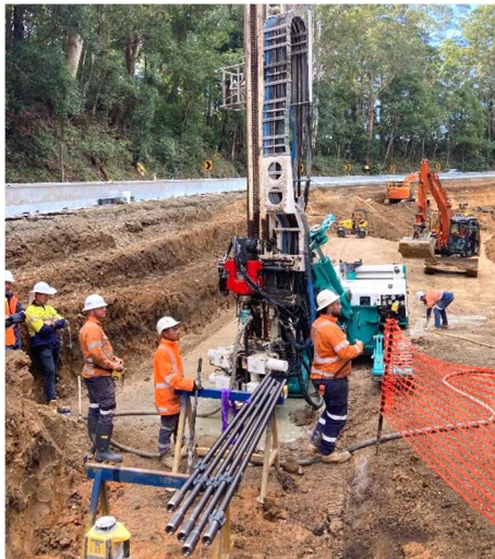
First Drill Hole at Site 1

The activities scheduled during the next month for both sites include completion of preliminary excavation, completion of working platform for drilling operation, excavation of working benches (a series of horizontal steps with near-vertical surfaces between them), completion of piling operation and construction of rock embankment at site 2. The works are expected to occur over 9 months from mid-May 2023 subject to weather, contractor, and material availability. This will involve piling and retaining wall construction works to allow repair of the landslips, reconstruction of pavement, reinstatement of road and guardrail barriers along with installing signs, guideposts, and line marking. Traffic control lights remain in place and existing single lane traffic control will remain in place during the works period. Council would like to thank the residents of the region for their patience during this time.