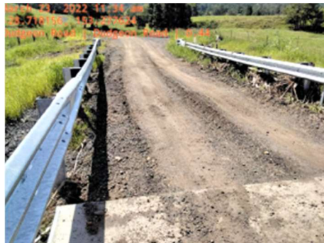
Dudgeon Bridge Approaches