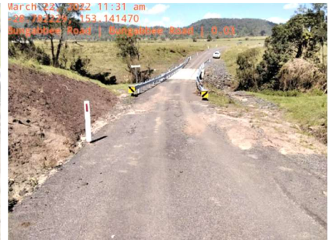
Bungabbee Bridge Approaches