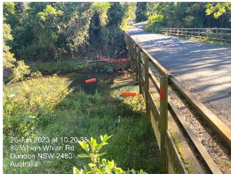
Vandalism at Site

We want to thank the local residents who use Whian Whian Road for their patience with what is a difficult process to repair Simes Bridge. Unfortunately, late Friday night (23rd June), the traffic barriers used to reduce the bridge to one lane were thrown over the edge and into the creek below. Simes Bridge suffered damage last year from massive weather events and shortly afterwards was inspected and assessed by independent engineers. The bridge is able to remain open to a single lane of traffic only. Single-lane access reduces the load impacting the bridge and avoids a closure to Whian Whian Road at this point. Traffic barriers are required to manage single-lane access. Criminal activity can be reported to the Police. Council has a call centre for reporting damages to community property; please phone 0266 250 500 or email council@lismore.nsw.gov.au