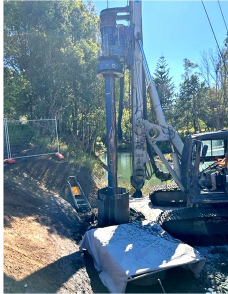
Town Road Bridge Piling