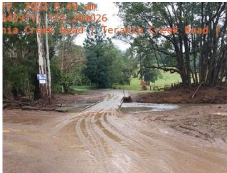
Site after flooding event

Following the 2022 natural disaster Terania Creek Road suffered extensive damage. Due to the nature and high number of damages incurred, works are being finalised on how best to provide timely improvements for the community and road users. The current structure at Branch Creek has received funding from the Disaster Recovery Funding Arrangements (DRFA) for replacement of the flood damaged asset. Works will include replacing the current box culvert structure with a 16m bridge and extending erosion protection to the edge of the road. The funding application for other damages on Terania Creek Road are currently being assessed. Survey and design work commenced in June 2023 for the replacement structure and works will commence in 2024.