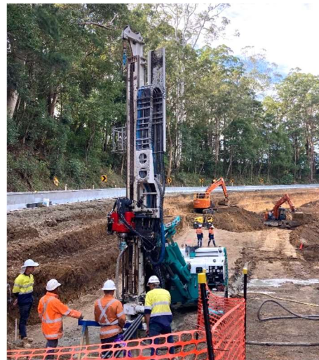
First Drill Hole at Site 1