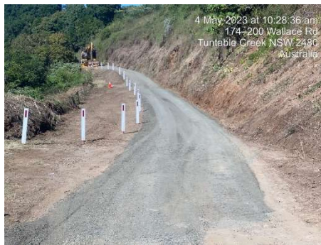
Wallace Road (After Works)