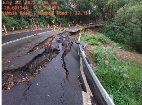
Nimbin Road landslip damage

Council commenced roadworks on two landslip sites on Nimbin Road during May. The first major construction works involve tree felling for both sites, with site one having larger trees which will land on the road. The works are expected to occur over 9 months from mid-May 2023 subject to weather, contractor, and material availability. This will involve piling and retaining wall construction works to allow repair of the landslips, reconstruction of pavement, reinstatement of road and guardrail barriers along with installing signs, guideposts, and line marking. Traffic control lights remain in place and existing single lane traffic control will remain in place during the works period. Road users are advised to follow VMS boards and signage, with delays expected as these works commence.