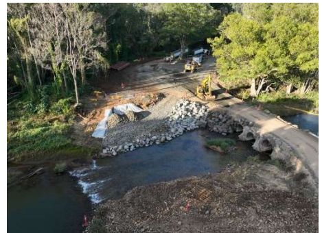
Temporary track construction