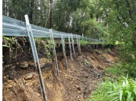
Nimbin Road landslip damage