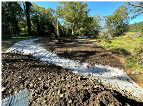
Temporary track construction

Funding was awarded by the NSW Government through its Fixing Country Bridges program to replace the damaged structure at Town Road, Terania Creek with a new steel superstructure bridge. The innovative steel structure has been constructed in France and will be launched into place in one piece. Unique for the area, this type of structure will be the first in the region. Works have recommenced at the site in April 2023, where a temporary track has now been constructed in preparation for bridges piling. A planned completion date is scheduled for September 2023, subject to weather, contractor, and material availability.