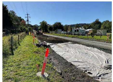
During construction works