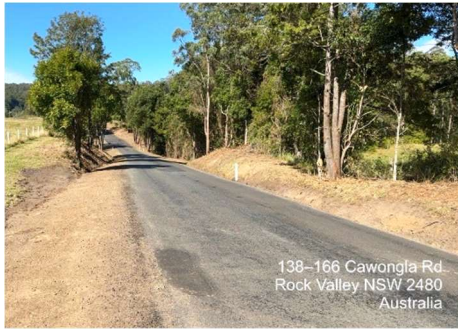
Completed Drainage Works

Drainage works on Cawongla Road are continuing with two new sections recently completed. It is anticipated work crews will reach the halfway mark next week. Council would like thank residents for their positive feedback and continued patience as the works progress.