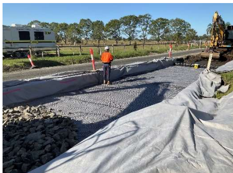
During construction works

During May, the rock bridging layer and subbase layer were completed for Wyrallah Ferry Road intersection, with works starting at the end of May on drainage. Pipes were also laid through the park at Wyrallah Ferry Road Intersection. During June, all drainage works are scheduled to be completed followed by site clean-up and project completion.