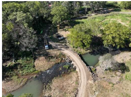
Temporary track construction