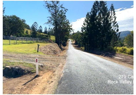
Completed Drainage Works