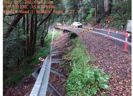
Nimbin Road landslip damage