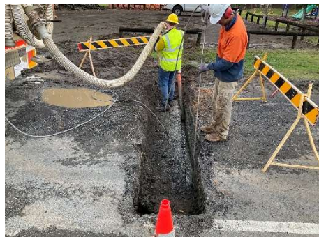
Pipe works in park at intersection