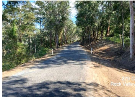
Completed Drainage Works