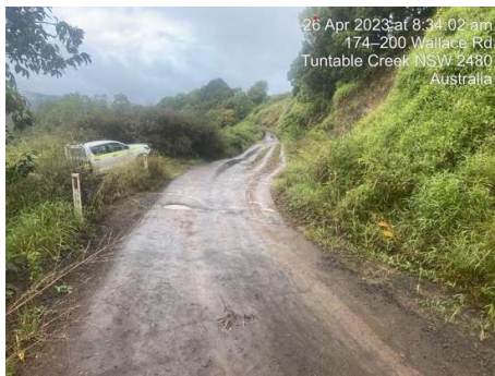
Wallace Road (Before Works)

Council recently completed temporary pavement patching works around the slip area on Wallace Road to improve road surface conditions. The works are a temporary measure, until permanent pavement rehabilitation works are scheduled.