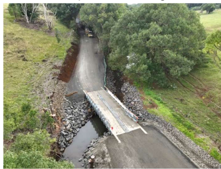
Bridge completed and guardrails installed