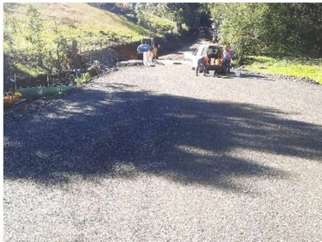
Bridge approach pavement works

https://yoursay.lismore.nsw.gov.au/maintaining-our-roads-and-bridges/news_feed/mackie-road-bridge-feb-2023