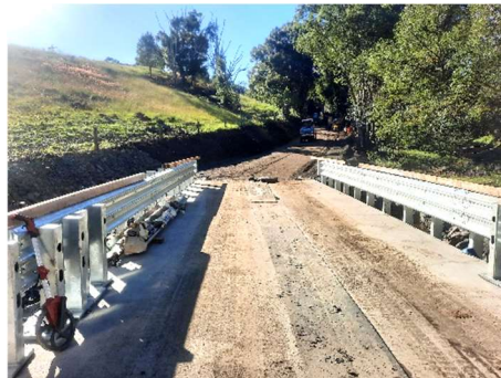
New bridge structure