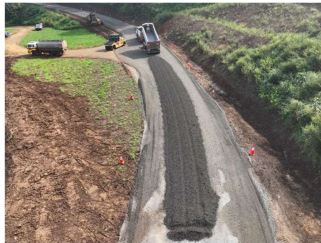
Tunable Falls Road aerial view of works