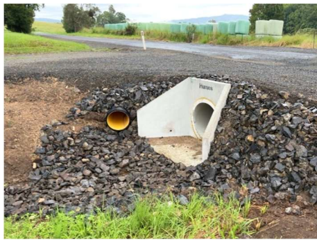
Crofton Road pipe installation works

All drainage and pipe work is scheduled to be completed by Thursday the 6 th of April. These works include desilt and reshape table drainage, installing headwalls and pipe extensions as required to ensure water runoff from the road, to prevent future road damages from occurring.