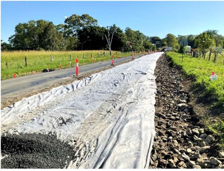
Wyrallah Road / Emily Street during works