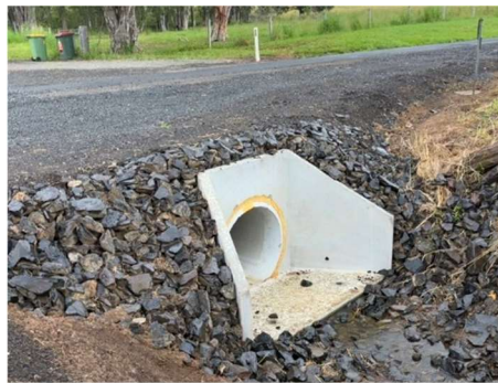
Crofton Road pipe installation works