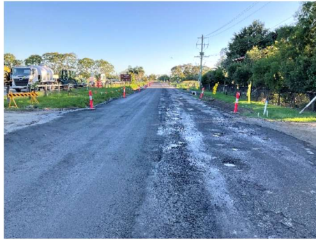
Wyrallah Road / Emily Street during works