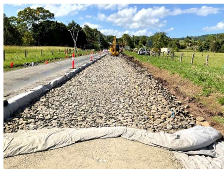
Wyrallah Road / Emily Street during works