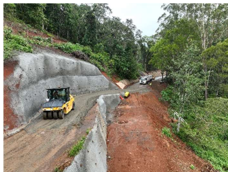
Tunable Creek Road works aerial view