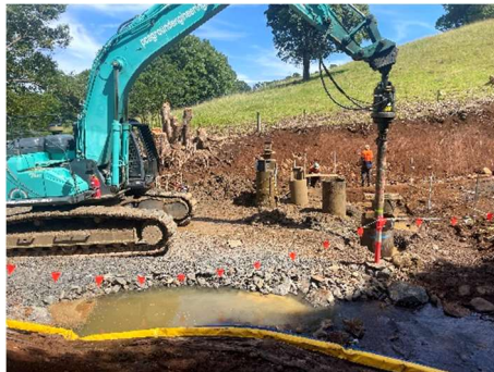
Mackie Road Bridge during construction