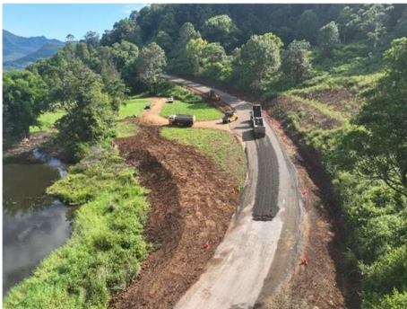
Tunable Falls Road aerial view of works

Temporary sealed patching works were recently completed for Tuntable Falls Road. These works involved placing overlay, stabilise, trim and sealing the road surface height to repair damages from the 2022 flooding event.