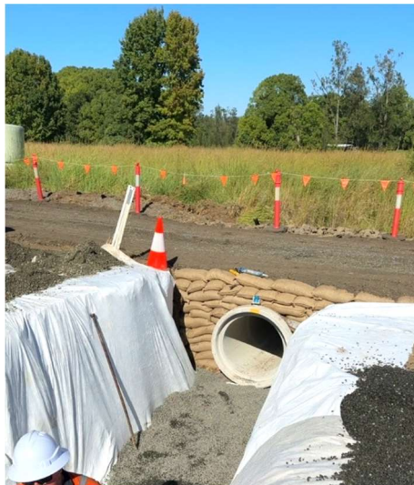
Crofton Road pipe installation works