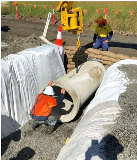
Crofton Road pipe installation works