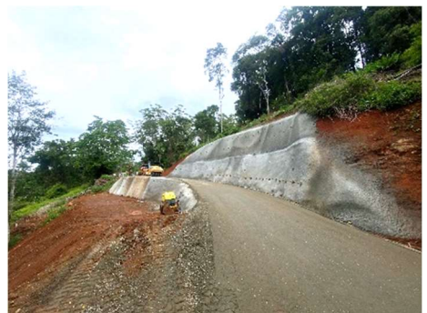
Tunable Creek Road during works