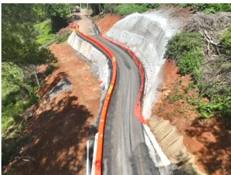
Tunable Creek Road temporary track

After establishing a baseline for the monitoring process and developing a management plan, the temporary track opened on Tuesday, the 14th of March. Due to the volatile nature of the landslip and risks of further damages occurring a detailed risk assessment was undertaken to control access until a permanent solution is implemented. The risk assessment requires weekly visual monitoring, survey monitoring of fixed control points and monthly inspections by a geotechnical engineer. Restrictions will be placed on the temporary access road during large rain events to mitigate risks to public. Should the road be closed due to adverse weather, VMS boards placed at The Channon and Nimbin will identify the road closure. Facebook updates will also communicate the closure to the wider community. Please report hazards or changes to Lismore City Council using reference LCC92.