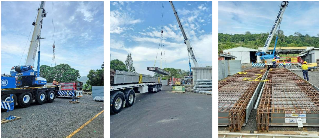
Mackie Road Bridge being delivered to the bridge storage yard

https://yoursay.lismore.nsw.gov.au/maintaining-our-roads-and-bridges/news_feed/mackie-road-bridge-feb-2023