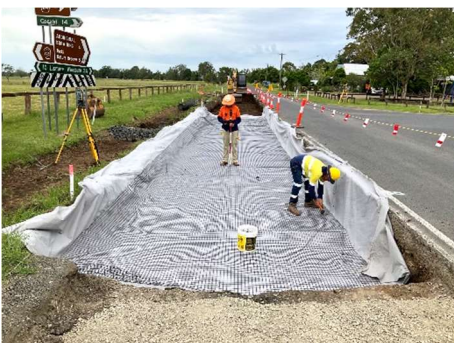
Wyrallah Road / Emily Street during works

https://yoursay.lismore.nsw.gov.au/maintaining-our-roads-and-bridges/news_feed/wyrallah-road-jan-2023