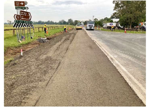
Wyrallah Road / Emily Street during works