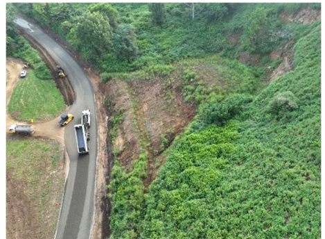
Tunable Falls Road aerial view of works