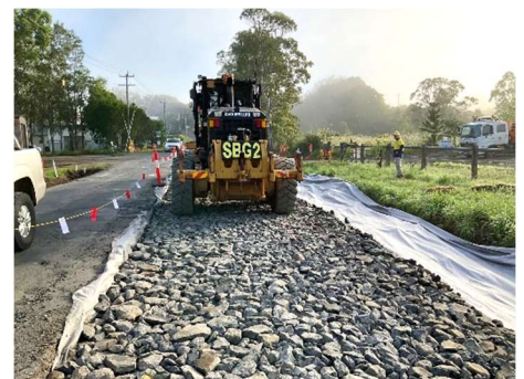
Wyrallah Road / Emily Street during works