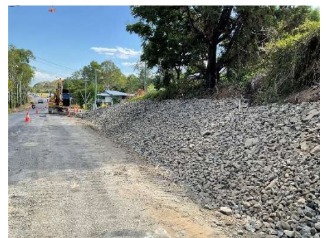
Wyrallah Road / Emily Street during works