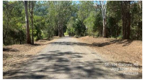
Gwynne Road after works