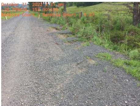
Howards Grass Road before works