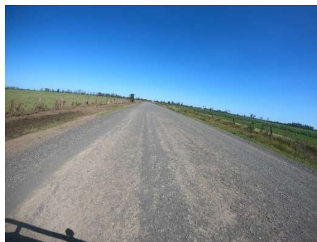
Sheehan Road after works