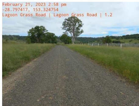
Lagoon Grass Road after works