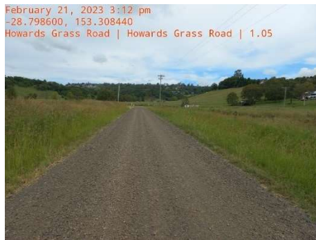
Howards Grass Road after works