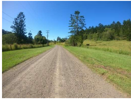
Boerie Creek Road after works