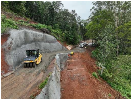
Tunable Creek Road during works

https://yoursay.lismore.nsw.gov.au/maintaining-our-roads-and-bridges/news_feed/tunable-creek-road-jan-2023