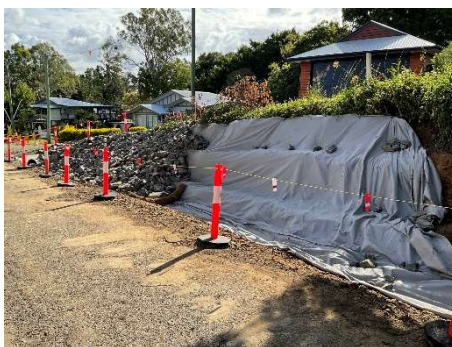
Wyrallah Road / Emily Street during works