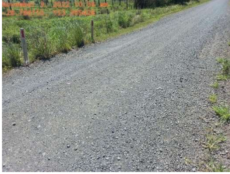
Cusack Road before works