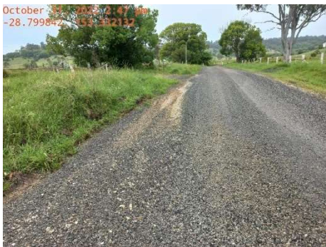
Lagoon Grass Road before works

Overlay works to repair damages from the October flood event were recently completed for Lagoon Grass Road, Howards Grass Road, Cusack Road, Boerie Creek Road, Hewitt Road, Swan Bay Road, and Sheehan Road.