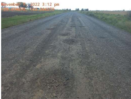
Sheehan Road before works