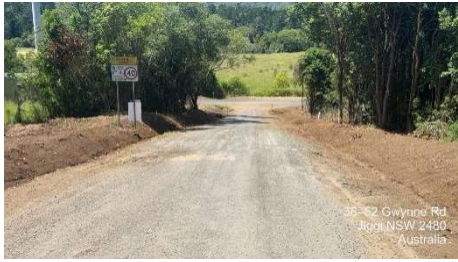
Gwynne Road after works

Temporary repair of damaged pavement was recently completed for Gwynne Road. During these works, the crews also performed scour repair and mulching vegetation along with cleaning drains and pipes to improve the roads condition.