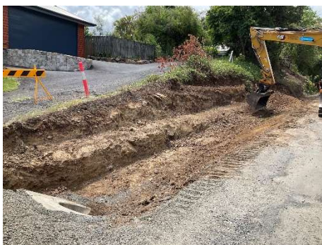
Wyrallah Road / Emily Street during works