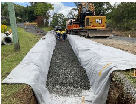
Wyrallah Road / Emily Street during works

https://yoursay.lismore.nsw.gov.au/maintaining-our-roads-and-bridges/news_feed/wyrallah-road-jan-2023