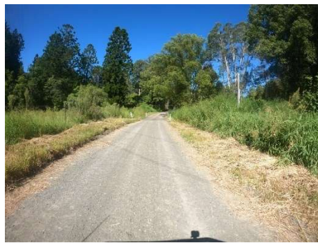
Hewitt Road after works