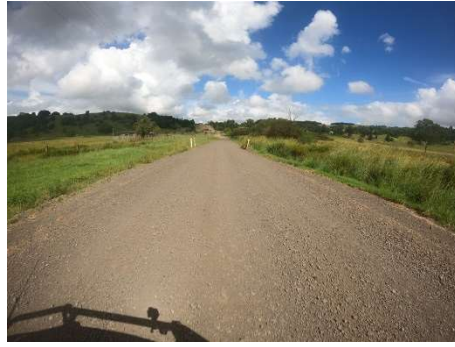
Cusack Road after works