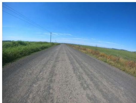
Swan Bay Road after works