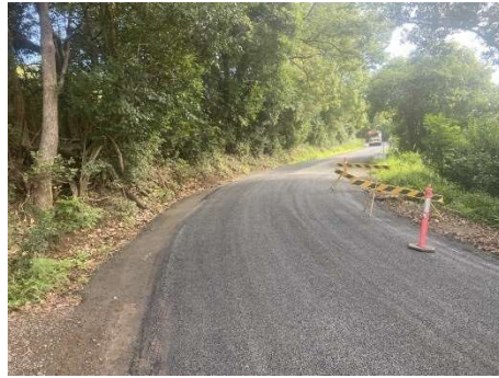
Johnston Road after works