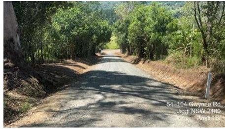
Gwynne Road after works