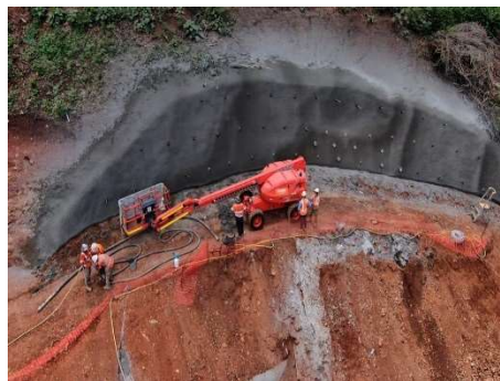
Tunable Creek Road works aerial view