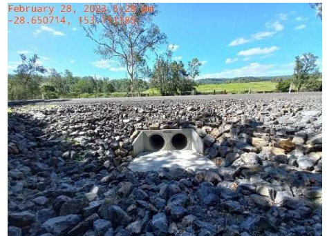
Cawongla Road after works