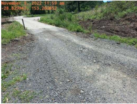
Boerie Creek Road before works