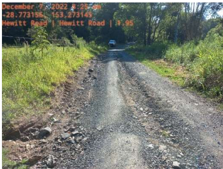
Hewitt Road before works