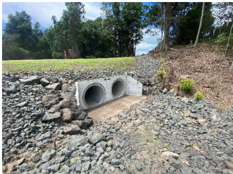
Cawongla Road after works

The Cawongla Road pipes' replacement project was ahead of schedule and the road opened at the end of January before school started. The works consisted of replacing two culverts that suffered significant damage during the 2022 floods.