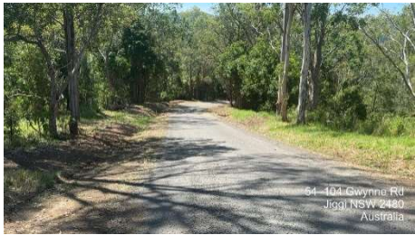
Gwynne Road after works