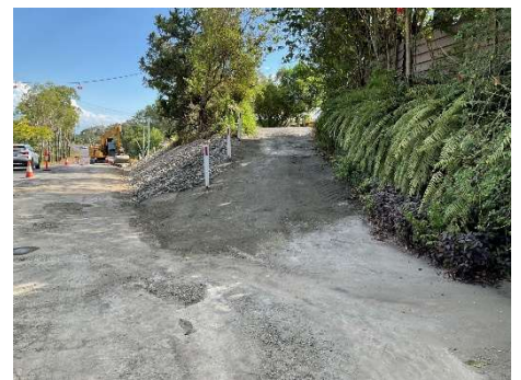
Wyrallah Road / Emily Street during works