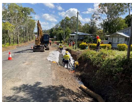
Wyrallah Road / Emily Street during works