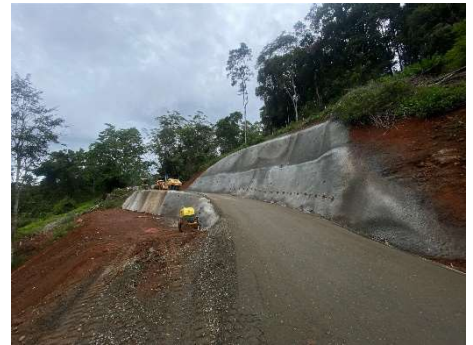
Tunable Creek Road during works