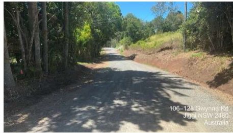
Gwynne Road after works