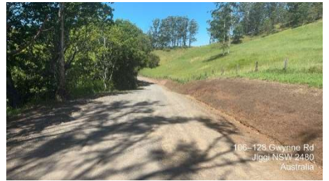
Gwynne Road after works