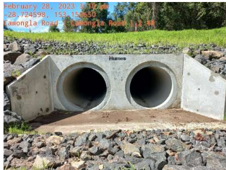
Cawongla Road after works