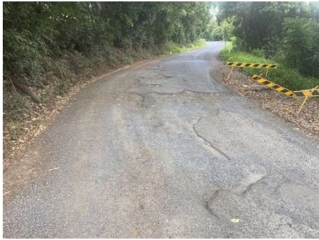
Johnston Road before works

Temporary patching works across slip single lane were recently completed for Johnston Road.