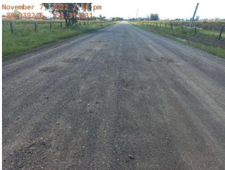
Swan Bay Road before works