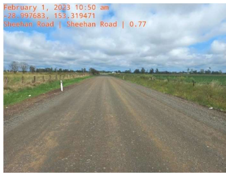
Sheehan Road (After Works)