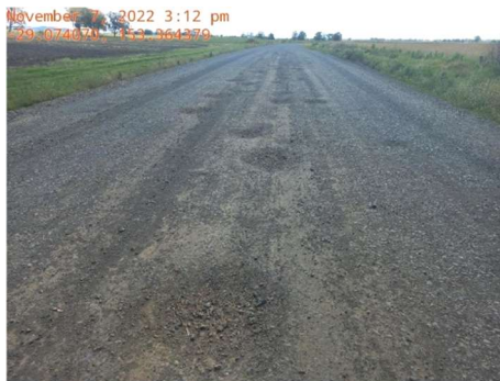
Sheehan Road (Before Works)

Works have been completed on Sheehan Road to address issues caused from the February and March 2022 floods. This has involved overlay and drainage works to repair flood damages.