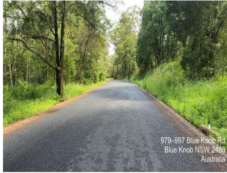
Blue Knob Road (After Works)