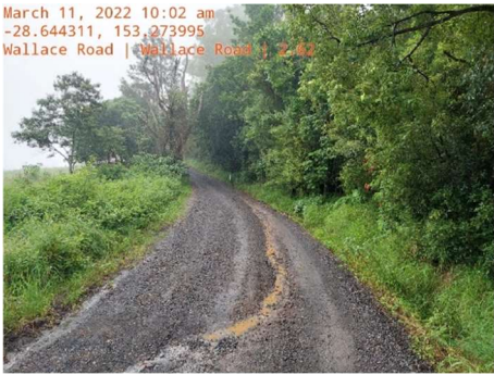
Wallace Road (Before Works)