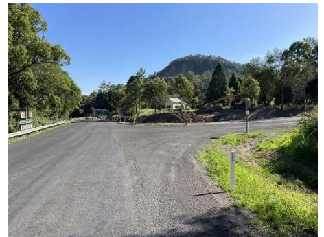
Blue Knob Road (After Works)