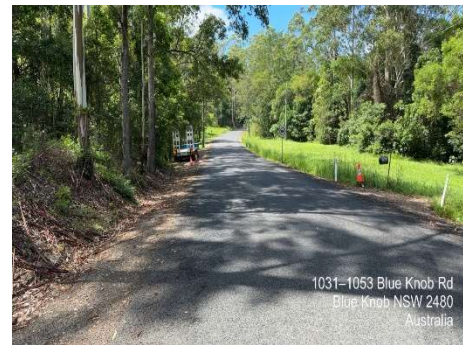
Blue Knob Road (After Works)

874-878 Blue Knob Rd Blue Knob NSW 2390 Australia