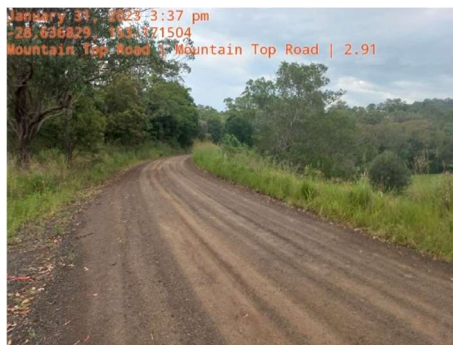
Mountain Top Road (After Works)