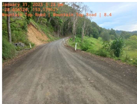
Mountain Top Road (After Works)