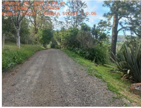
Nimbin Street (After Works)