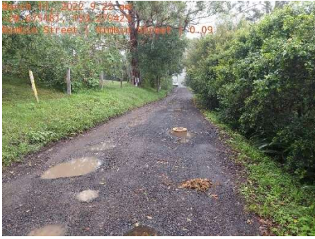
Nimbin Street (Before Works)