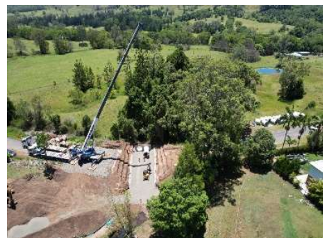
Aerial view of pipe installation