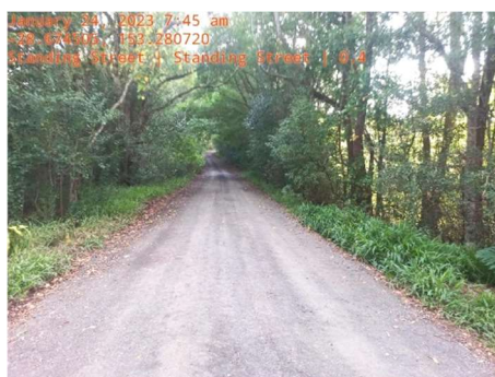
Standing Street (After Works)