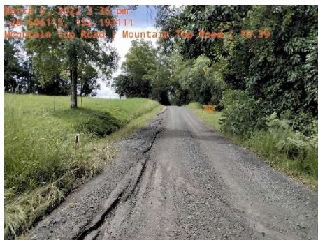
Mountain Top Road (Before Works)

Overlay works have been completed on Mountain Top Road, Standing Street, Nimbin Street and Wallace Road, to address issues caused from the February and March 2022 floods.