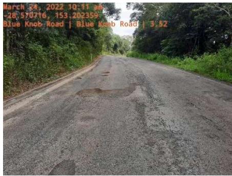
Blue Knob Road (Before Works)