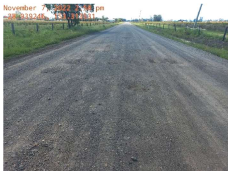
Swan Bay Road

Overlay and drainage works are currently underway to repair damages from the October flood event for Swan Bay Road.