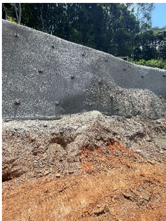
Tunable Creek Road Soil Nails