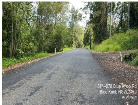
Blue Knob Road (After Works)