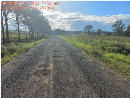
Munro Wharf Road

Overlay and drainage works to repair damages from the October flood event will commence shortly for Munro Wharf Road.