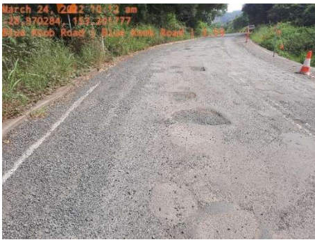
Blue Knob Road (Before Works)

Works are completed for Blue Knob Road, these included removing and replacing the existing material from the road surface, along with grading and rolling the road with a temporary seal over the new surface. A planned return to complete permanent works will be scheduled during 2023.