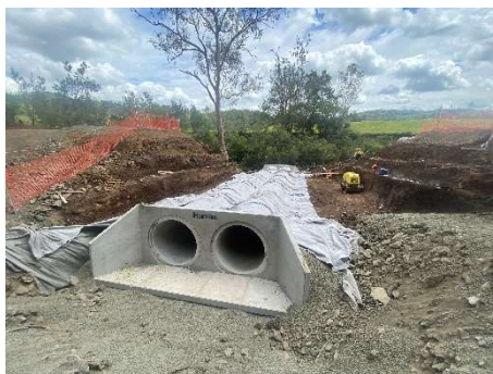
1350mm twin cell pipes and headwalls