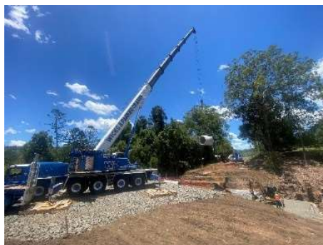
South Site – Twin Cell 1800mm Pipes