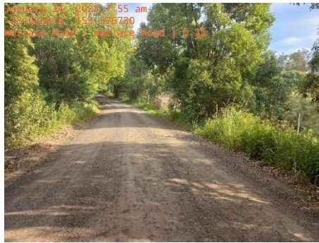
Wallace Road (After Works)