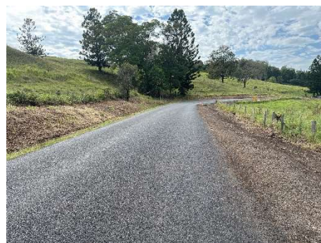
Rock Valley Road