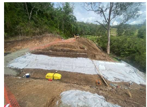
1350mm twin cell pipes and headwalls