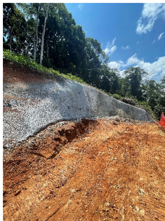
Tunable Creek Road Soil Nails