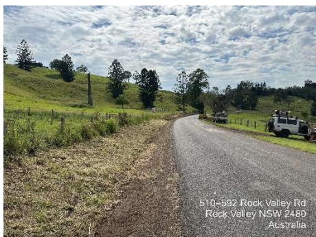
Rock Valley Road