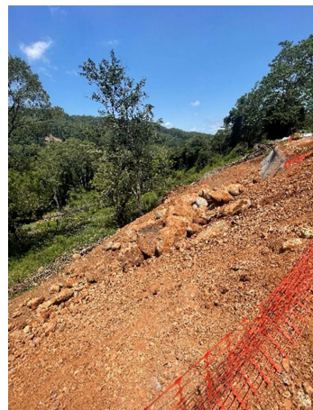
Tunable Creek Road Works