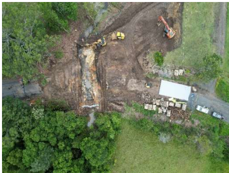
Culvert replacement works

https://yoursay.lismore.nsw.gov.au/maintaining-our-roads-and-bridges/news_feed/cawongla-road-jan-2022