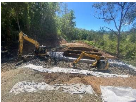
North Site – Twin Cell 1350mm Pipes