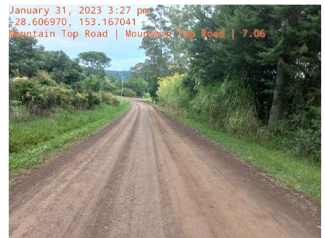
Mountain Top Road (After Works)