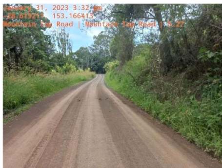
Mountain Top Road (After Works)