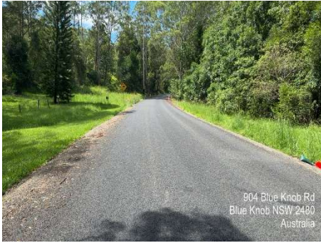
Blue Knob Road (After Works)