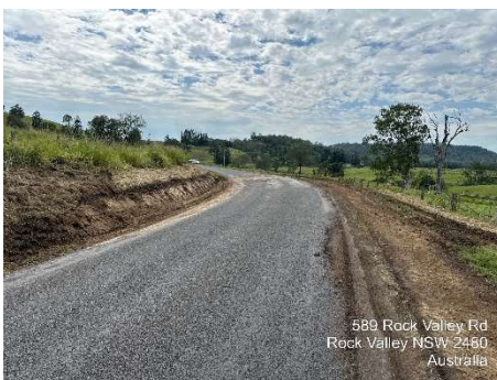
Rock Valley Road