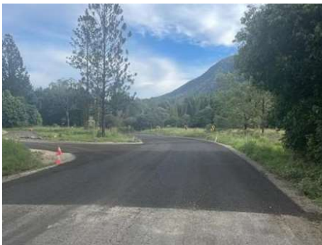
Blue Knob Road (After Works)