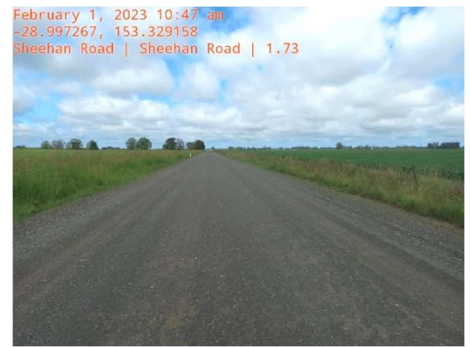
Sheehan Road (After Works)