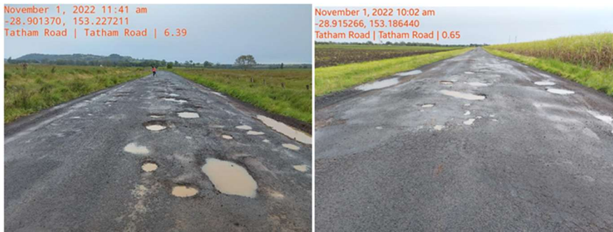
Image: Tatham Road before works

Remove and replace existing material from the road surface, grade and roll the road with a temporary seal over the new surface. A planned return is scheduled for 2023 to complete permanent works.