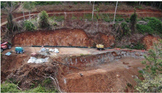
Image: Images of restoration works