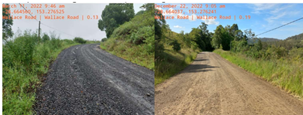
Image: Wallace Road before and after images

Wallace Road has recently undergone repair work up to the landslip. Overlay and drainage works are now completed to restore damages caused from the February and March 2022 floods.