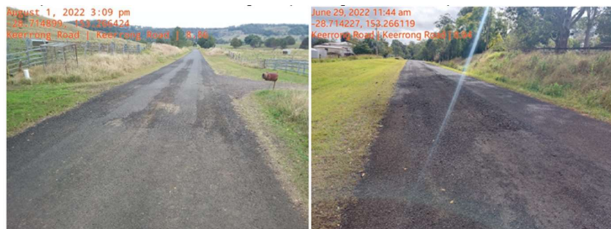
Image: Keerrong Road

Overlay, stabilise, trim and seal road surface to repair damages from the February and March, 2022 floods.