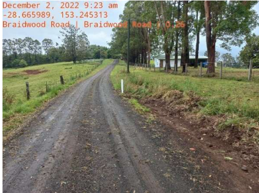
Image: Braidwood Road completed works

Braidwood Road has recently had unsealed road works completed, the below image outlines the after result for the road.