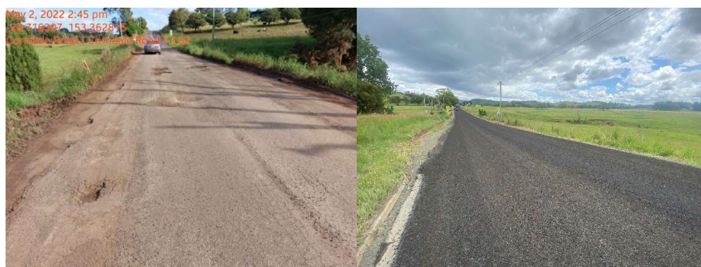
Image: Corndale Road before and after images

Corndale Road continues to undergo works to replace existing road surface, stabilise, trim and seal of existing road surface height to repair damages from the February and March 2022 floods.