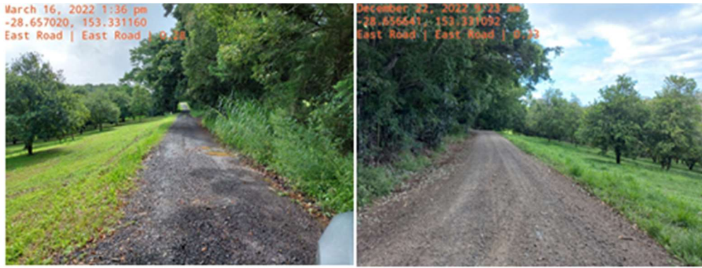
Image: East Road before and after images