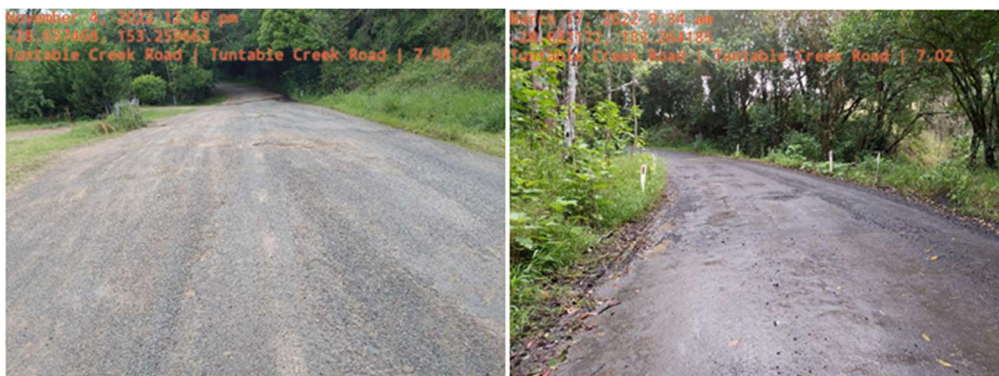
Image: Tuntable Creek Road works

Remove and replace existing material from the road surface, grade and roll the road with a temporary seal over the new surface. A planned return is scheduled for 2023 to complete permanent works.