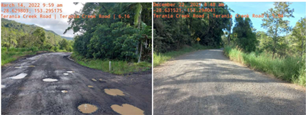
Image: Terania Creek Road before and after images

Work is currently underway between The Channon and Lawler Road on Terania Creek Road due to a landslip after Lawler Road. Overlay and drainage work are underway to repair damages caused from the February and March 2022 floods.