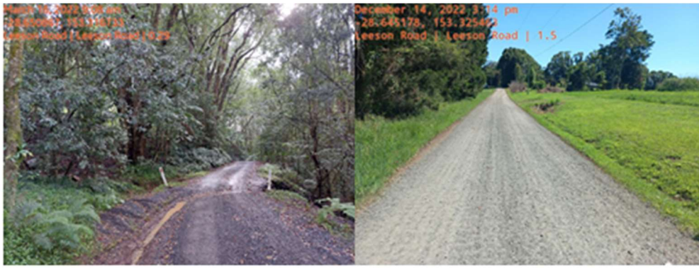
Image: Leeson Road before and after images