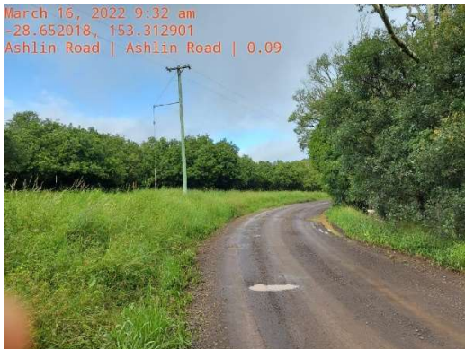
Image: Ashlin Road before works

Ashlin Road recently underwent repair works, these are now completed. The image below shows the before image of the roads condition.