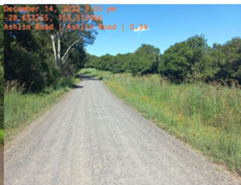
Image: Ashlin Road before and after images