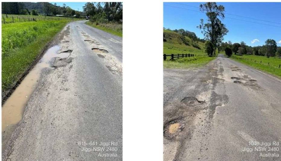
Image: Jiggi Road flood damage

Likewise, Jiggi Road has undergone recent works to address issues caused from the February and March 2022 floods. This has involved overlay, stabilise, trim and seal road surface to repair damages.