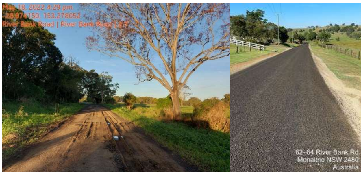
Image: Riverbank Road before and after

Works are continuing for Riverbank Road to repair the issues caused from the February and March 2022 floods, restoration works have been performed on Riverbank Road. These involved overlay, stabilise, trim and seal road surface to repair flood damages.