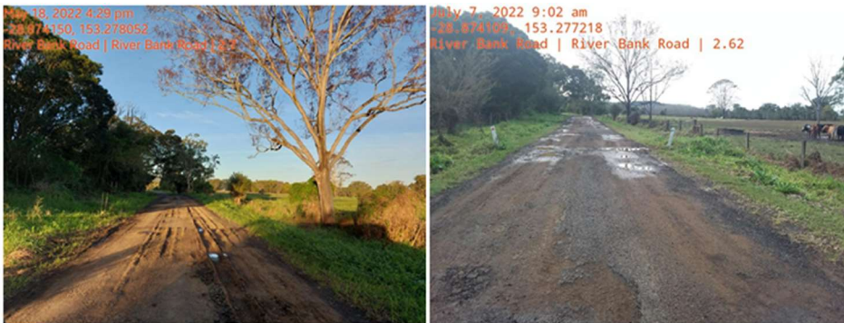
Image: Riverbank Road flood damage

To repair the issues caused from the February and March 2022 floods, restoration works have been performed on Riverbank Road. These involved overlay, stabilise, trim and seal road surface to repair damages.