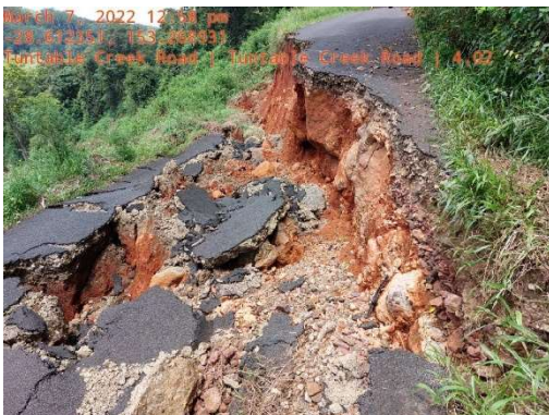
Image: Image of embankment failure before restoration works

Restoration works are continuing along Tuntable Creek Road. Landslip repairs are currently underway through stabilisation works to allow rehabilitation of landslip and reinstatement of road and guardrail barrier.