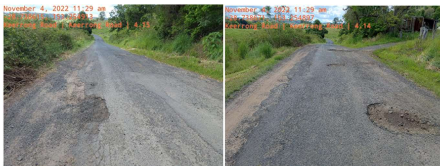
Image: Keerrong Road

Desilt and reshape table drainage, while installing headwalls and pipe extensions as required to ensure water runoff from the road, to prevent future road damages from occurring.