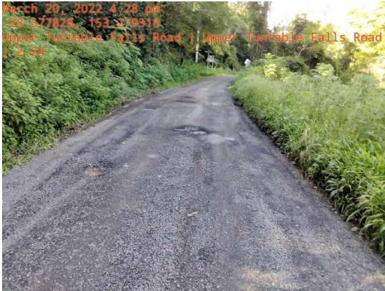
Image: Upper Tuntable Falls Road before works

Repair work was recently carried out and are now completed for Upper Tuntable Falls Road. The image below shows the before image of the roads condition.