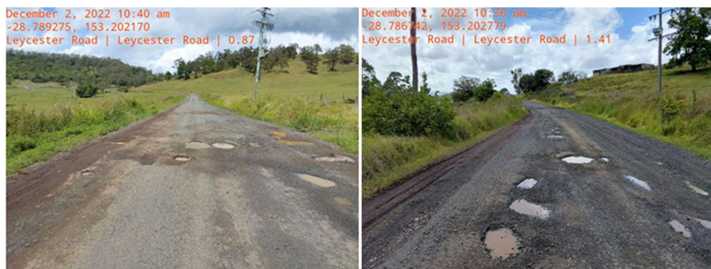
Image: Leycester Road before works

Remove and replace existing material from the road surface, grade and roll the road with a temporary seal over the new surface. With a planned return to complete permanent works in 2023.