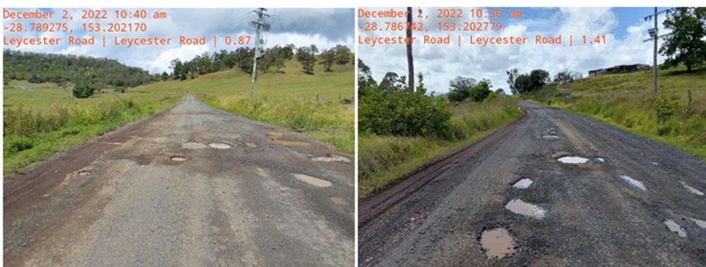
Image: Leycester Road before works

Remove and replace existing material from the road surface, grade and roll the road with a temporary seal over the new surface. With a planned return to complete permanent works in 2023.