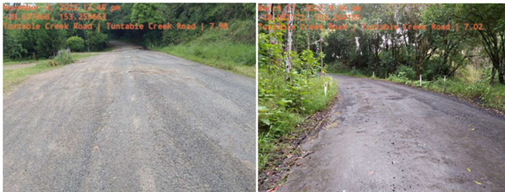
Image: Tuntable Creek Road

Remove and replace existing material from the road surface, grade and roll the road with a temporary seal over the new surface. A planned return is scheduled for 2023 to complete permanent works.