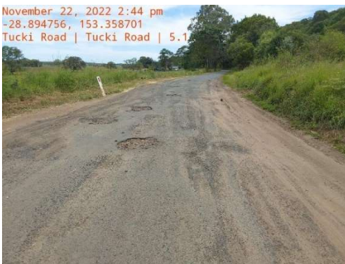
Image: Tucki Road before works image

Tucki Road works have removed and replaced existing material from the road surface, graded and rolled the road with a temporary seal over the new surface. A planned return is scheduled for 2023 to complete permanent works.