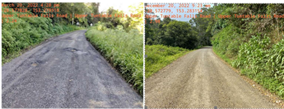
Image: Upper Tuntable Falls Road before and after images

Repair work was recently carried out for Upper Tuntable Falls Road. Overlay and drainage works are now completed to restore damages caused from the February and March 2022 floods.