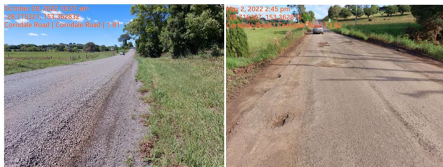
Image: Corndale Road

Replace existing road surface, stabilise, trim and seal of existing road surface to repair damages from the February and March, 2022 floods.