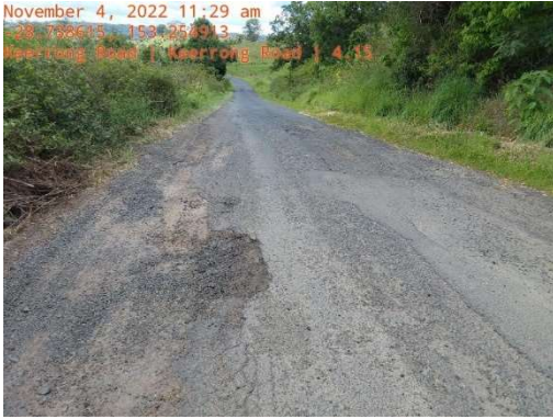
Image: Keerrong Road works