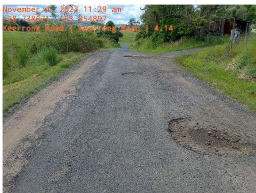
Image: Keerrong Road works

Works are continuing along Keerrong Road to overlay, stabilise, trim and seal road surface to repair damages from the February and March, 2022 floods.