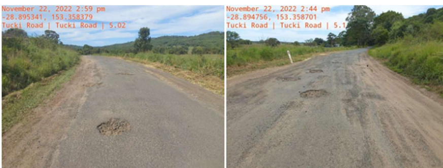
Image: Tucki Road before works

Remove and replace existing material from the road surface, grade and roll the road with a temporary seal over the new surface. A planned return is scheduled for 2023 to complete permanent works.