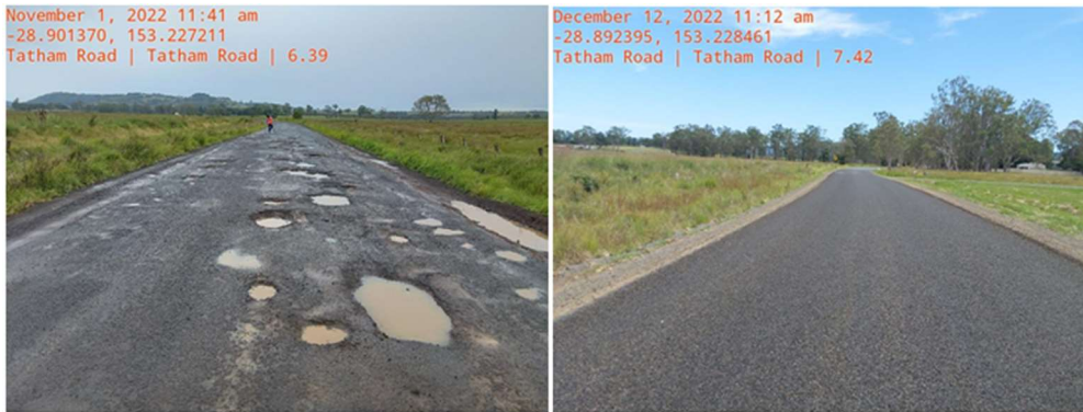
Image: Tatham Road before and after images

Works were completed on Tatham Road to remove and replace existing material from the road surface, grade and roll the road with a temporary seal over the new surface. A planned return is scheduled for 2023 to complete permanent works.