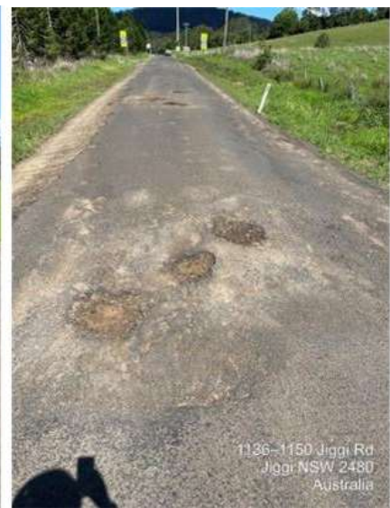
Image 16, 17 & 18: Identified pavement repairs required on Jiggi Road