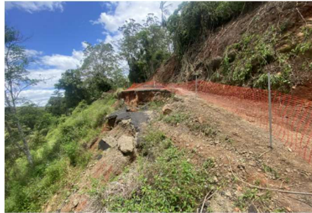
Image 1: "Slikenside" (Geotech term) – evidence of historic landslide at this location