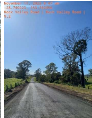
Image 25-29: Pavement identified are requiring works for Rock Valley Road and Cawongla Road