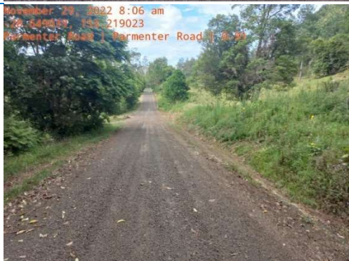
Image 33-36: Unsealed pavements completed for Houlden Road, Gordon Road, Savins Road and Parmenter Road