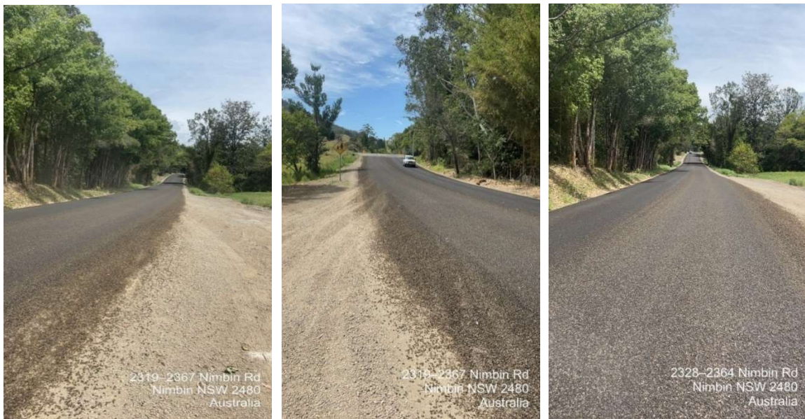
Image 10, 11 & 12: Pavement works for Nimbin Road near Shipway Road intersection

Pavement works have been completed at Nimbin Road near the intersection of Shipway Road.