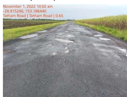
Image 30-32: Tatham Road temporary pavement identified are requiring works