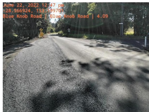
Completed Emergency Works