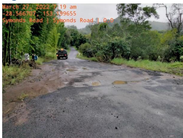
Assessed Pavement Damage