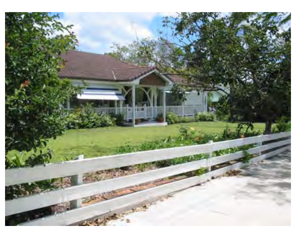
Examples of dwellings with projecting centre gables and low front fence treatment in the Dalley Street Conservation Area.