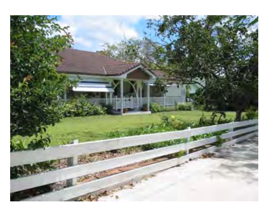
Post and Rail Fence