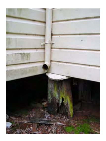
Keeping a building dry is fundamental to its long term conservation. Proper dispersal of stormwater from footings is essential but often overlooked.