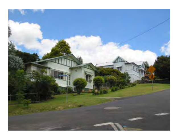
Projecting gables and subsidiary gables are repeated in this streetscape. This roof design could be reflected in a design for infill development without being an exact copy.