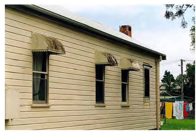
Typical double hung sash windows, with metal window hoods.