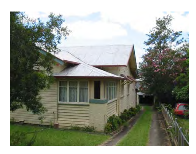
Example of an early enclosed verandah