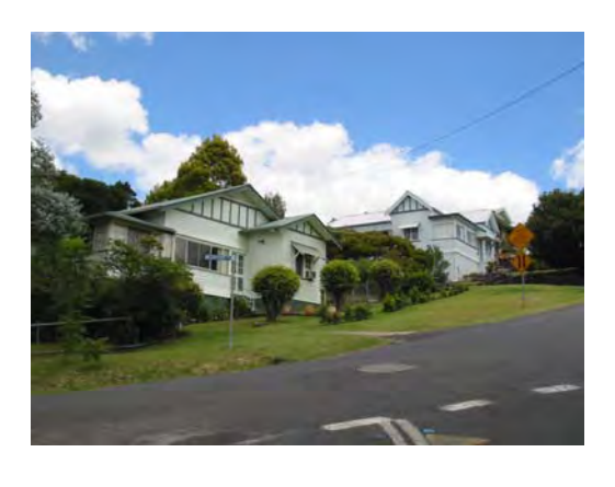
The steeply sloping hill enhances the setting of the dwellings.