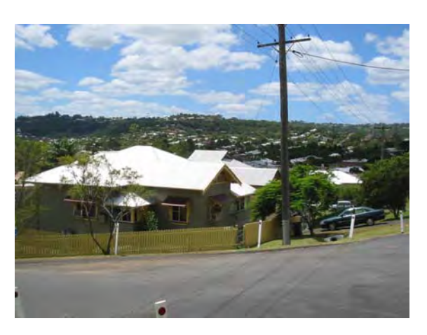
A typical hipped roof with projecting gable