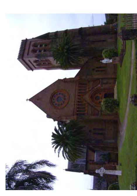
St Carthages Cathedral is visually prominent and very important to the precinct