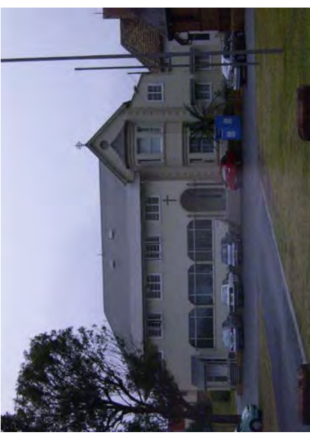
Architectural and aesthetic qualities of the precinct on an elevated site