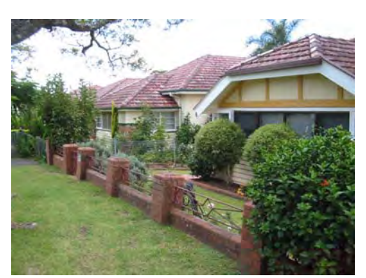
Low fences typical with inter-war dwellings.