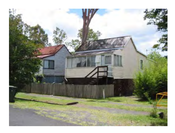
Early cottages in Parkes St