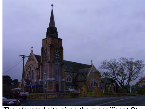
The elevated site gives the magnificent St Andrews Church landmark prominence