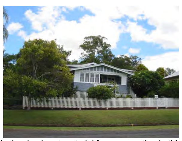
Timber is the dominant material for construction in this locality.

"The Girards Hill precinct is notable as a diverse collection of houses unified by their consistent use of timber and iron. This consistent period feature distinguishes Lismore from other towns in the region which have lost much of this character, or which developed using quite different materials. The townscape value of the area also derives from the imposition of a modified street grid on a sloping hillside. This provides for dramatic siting of houses and enhances views into and out of the area. Narrow street pavements with grassed verges in many of the streets contribute to a strong perception of a semi rural urban from. This area features many fine buildings as well as good private gardens and trees. There are however, many unsympathetic intrusions Regional Significance."