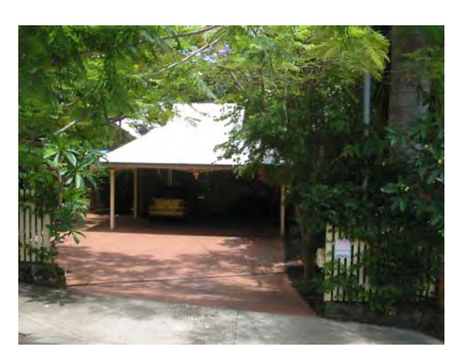
Example of a typical garage sited towards the rear of the allotment.

Example of a car port designed to complement the dwelling with similar roof pitch and form