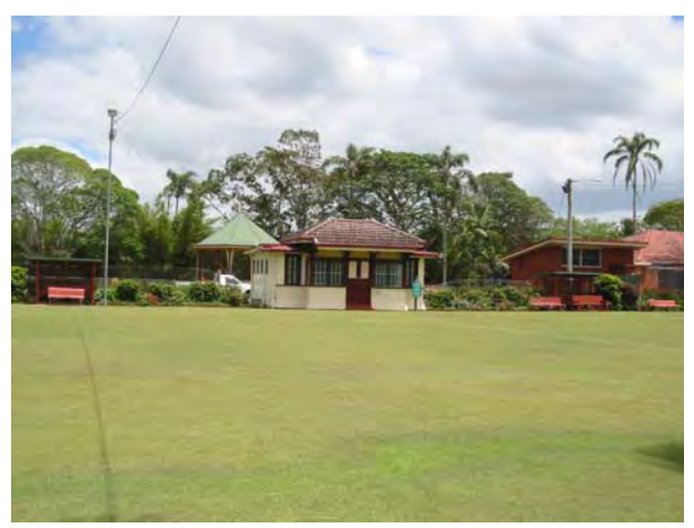
Spinks Park Croquet Club with the Rotunda behind

"Important concentration of buildings forming an attractive period townscape. Setting enhanced by park and proximity to the river and centre of town. Buildings of note on Molesworth and Magellan Streets include several public, civic and commercial buildings. The former post office building is a fine landmark on the corner of the two streets. The grouping marks the historic shift of the town centre from its original focus, north of Woodlark St."