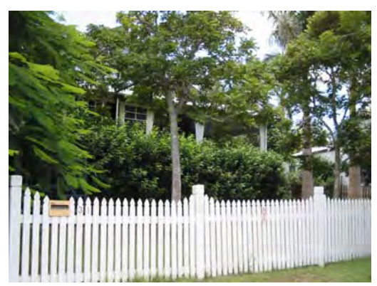
Timber Picket fence