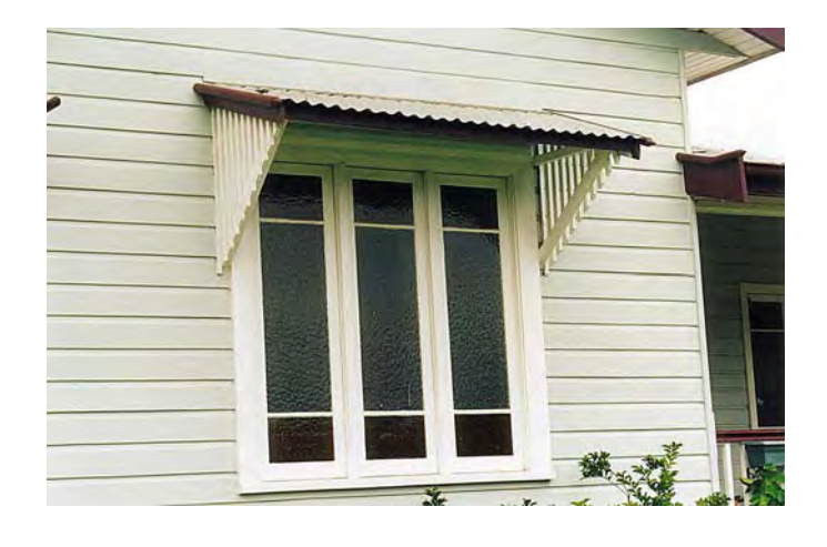
Example of a 12 pane double hung sash Example of casement windows with long narrow proportions.