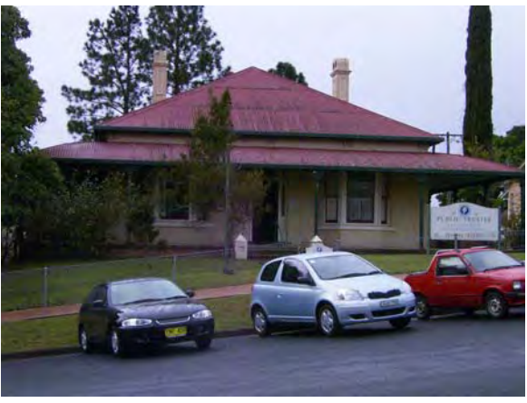
Former Methodist Manse which is now used as the Public Trustees office