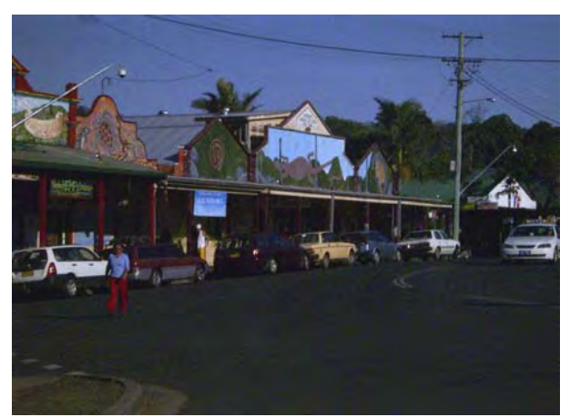
Unique Main Street.