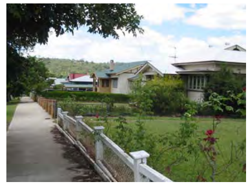
Consistent low fences here create an appealing streetscape.