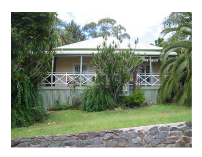
Bullnose verandah with traditional hipped roof to main dwelling. The balustrade may be a later addition.