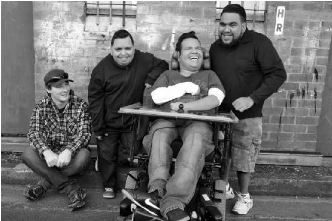
Image of Brotherhood of the Blues, BackAlley Gallery