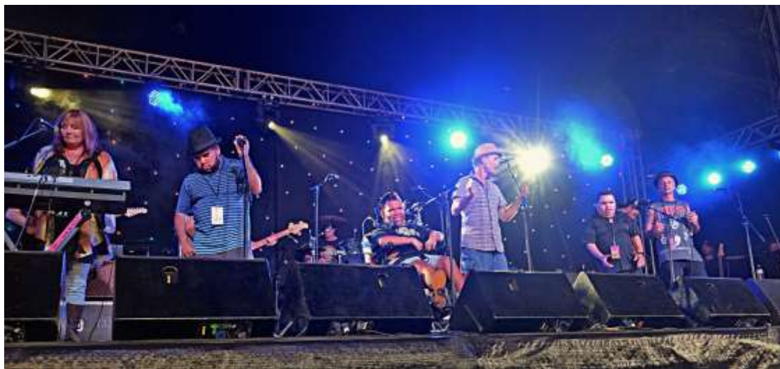
Image of Blues Festival Live, Byron Bay

For the focus area Support Access to Employment we will use data to measure the increase of people with disability that are employed at Council, the accessibility of Council work places and the increase in the number of Council suppliers that provide employment opportunities to people with disability.